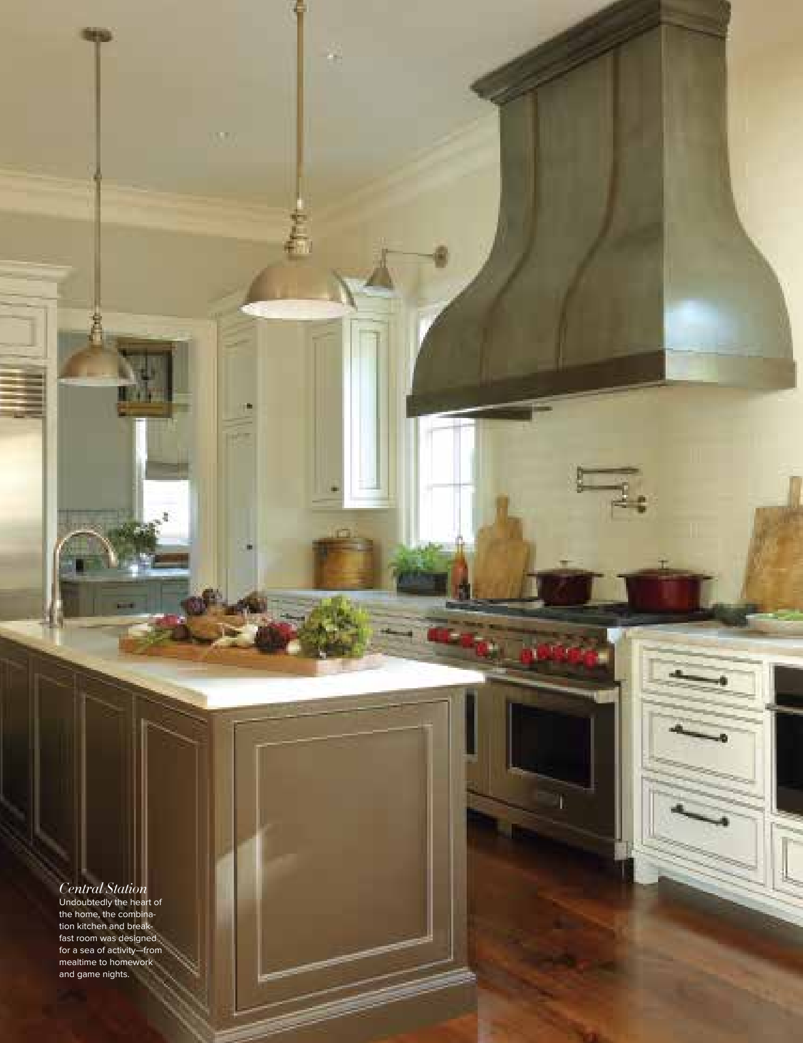
Central Station Undoubtedly the heart of the home, the combination kitchen and breakfast room was designed for a sea of activity—from mealtime to homework and game nights.

“They’re a wonderfully welcoming family, so you’ll always find the children’s friends hanging around, and the dogs are likely running back and forth in the background,” says the designer. “There’s a great interconnectedness between the rooms on the first floor, which makes it a really ideal space for gathering.”