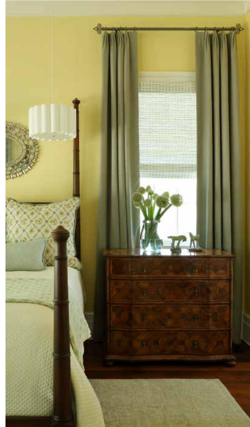
Sunny Suite The master suite's cheerful yellow palette was inspired by the wife's request for a "bright and happy" room. The sunny hue continues into the master bath, where a geometric textile by Stroheim adds a pop of pattern. opposite A private seating area in the master suite features a limestone fireplace by Francois & Co. and offers Cheryl a quiet place to read or knit.