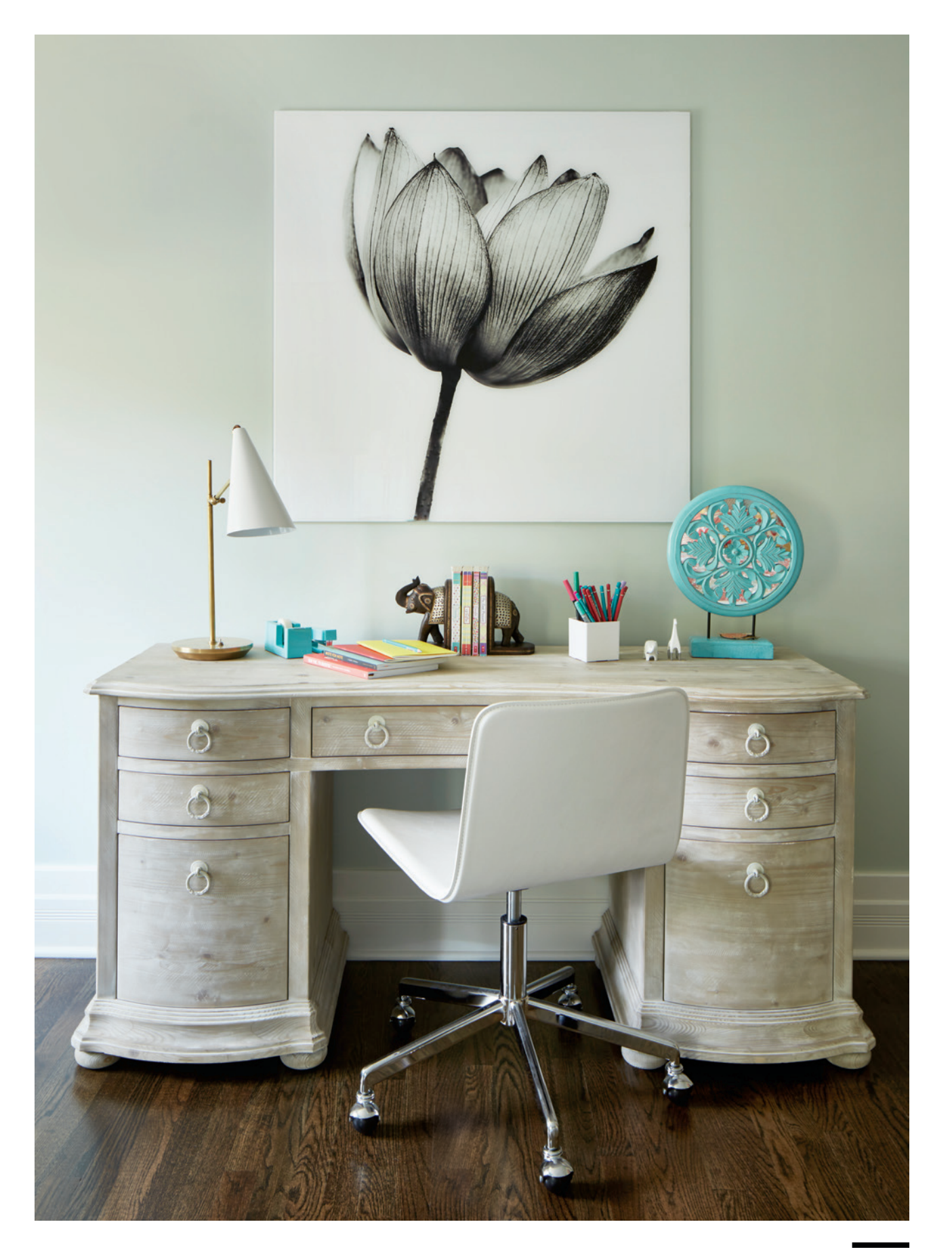
RH's Ariane storage desk is the perfect spot for finishing homework assignments in a bedroom. The Clemente table lamp is by Aerin for Circa Lighting; the desk chair is from CB2.