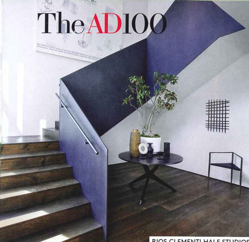
RIOS CLEMENTI HALE STUDIOS