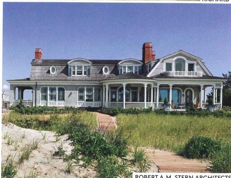
ROBERT A.M. STERN ARCHITECTS