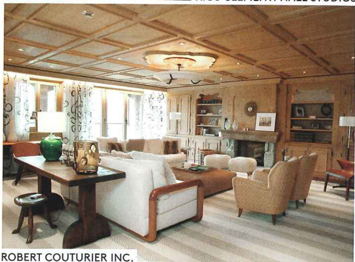
ROBERT COUTURIER INC.