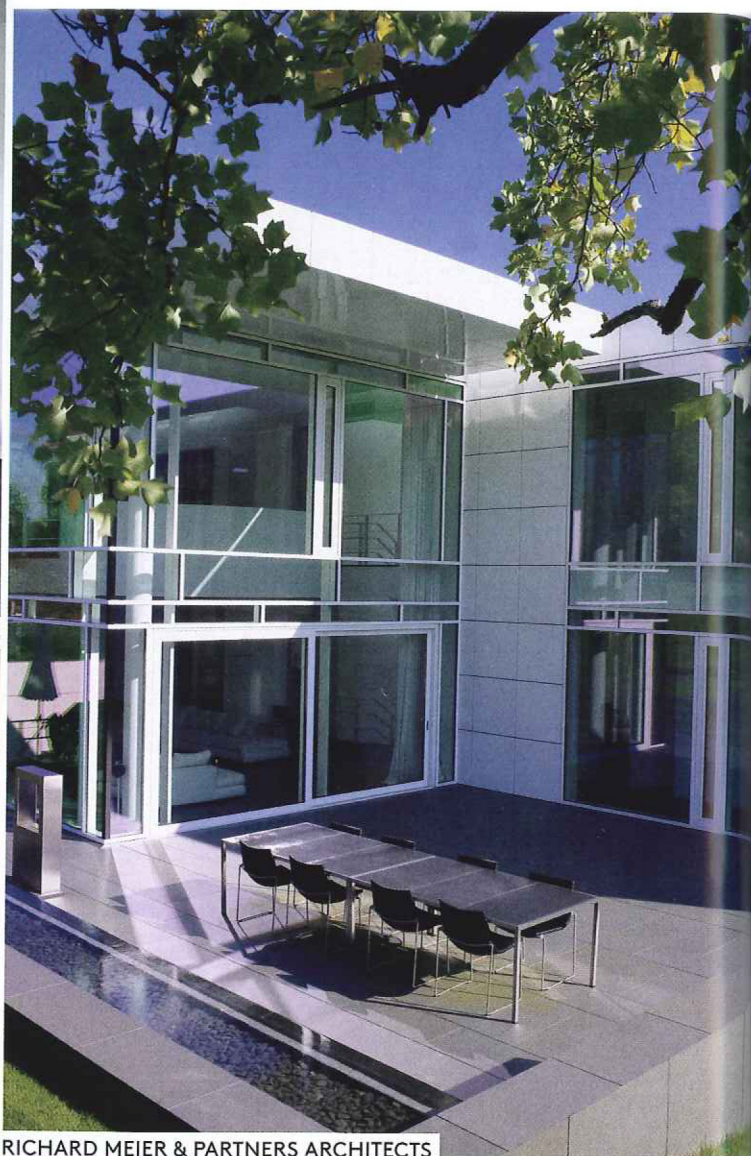
RICHARD MEIER & PARTNERS ARCHITECTS