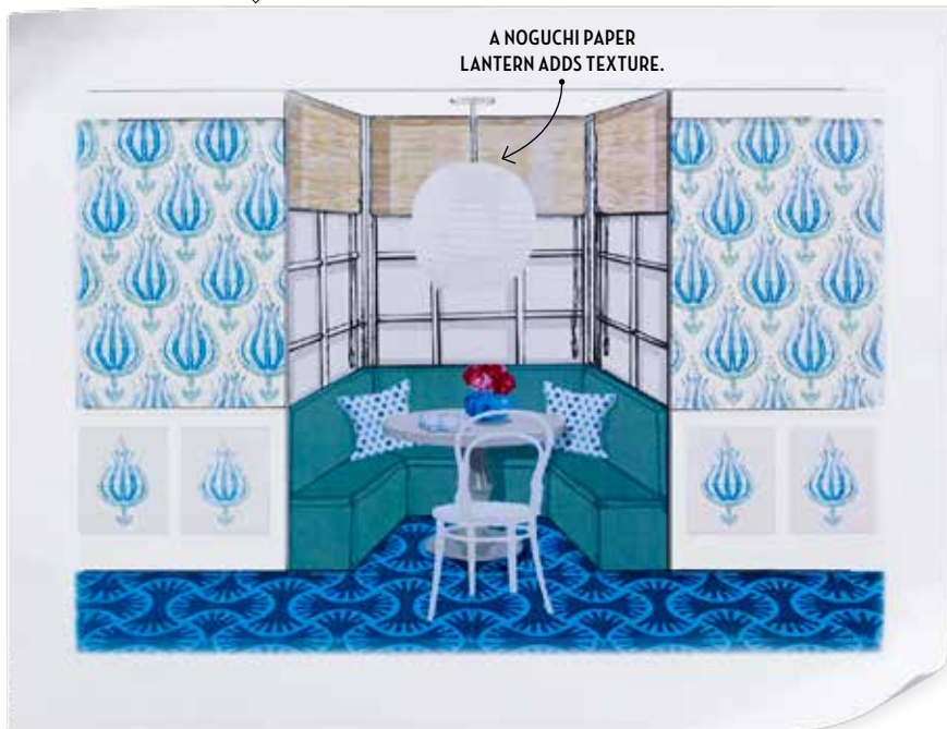
A NOGUCHI PAPER LANTERN ADDS TEXTURE.