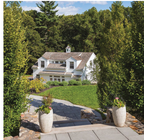
THIS PAGE, CLOCKWISE FROM TOP