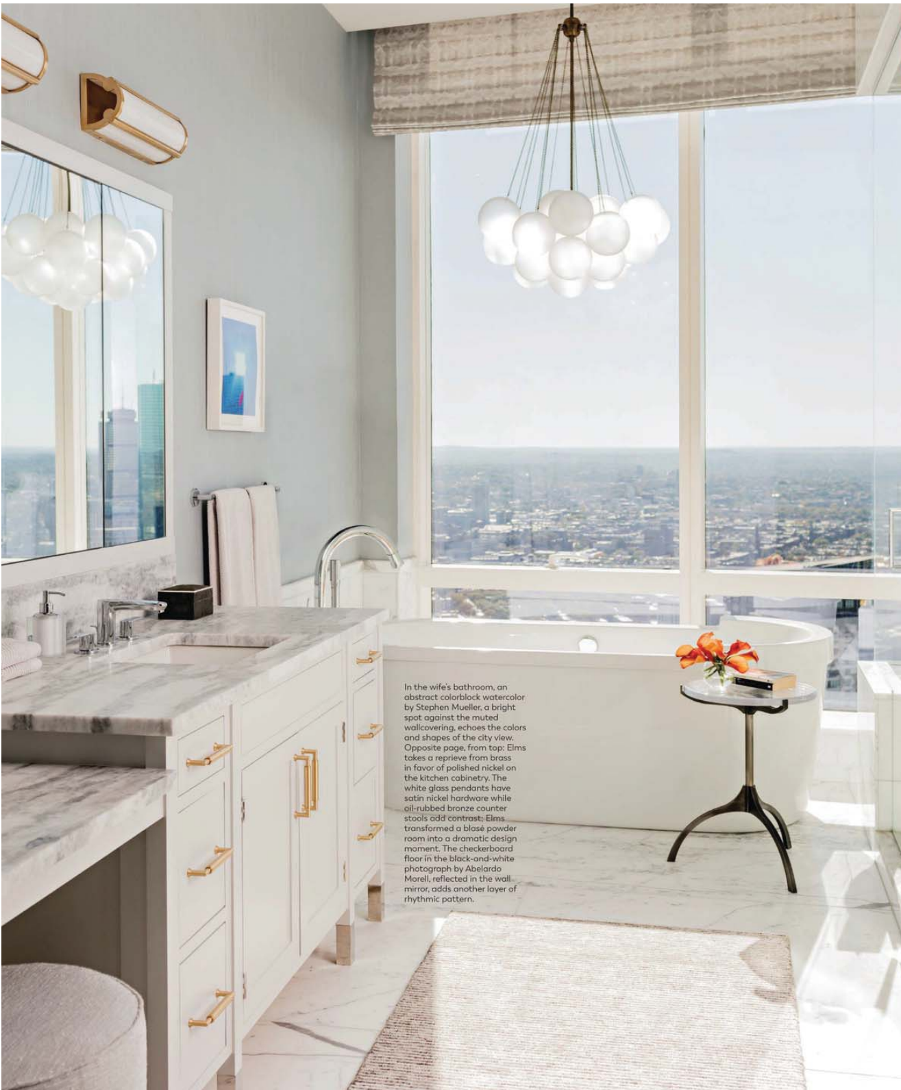
In the wife's bathroom, an abstract colorblock watercolor by Stephen Mueller, a bright spot against the muted wallcovering, echoes the colors and shapes of the city view. Opposite page, from top: Elms takes a reprieve from brass in favor of polished nickel on the kitchen cabinetry. The white glass pendants have satin nickel hardware while oil-rubbed bronze counter stools add contrast; Elms transformed a blasé powder room into a dramatic design moment. The checkerboard floor in the black-and-white photograph by Abelardo Morell, reflected in the wall mirror, adds another layer of rhythmic pattern.

Designer Dee Elms' clients didn't trade up from a pied-à-terre overlooking the Public Garden to a penthouse unit on the 56th floor of Millennium Tower because it wasn't working for them, but rather, because it was. The out-of-town empty nesters were so enthralled with Boston that they wanted to spend more time here. Bewitched by the brand-new 675-foot-high shimmering edifice, the couple purchased a 3,172-square-foot three-bedroom unit, ensuring plenty of space for visiting children and grandchildren. "The Boston design scene has exploded, rethinking the way we live and feel," Elms says. "We're excited to be part of the evolution."