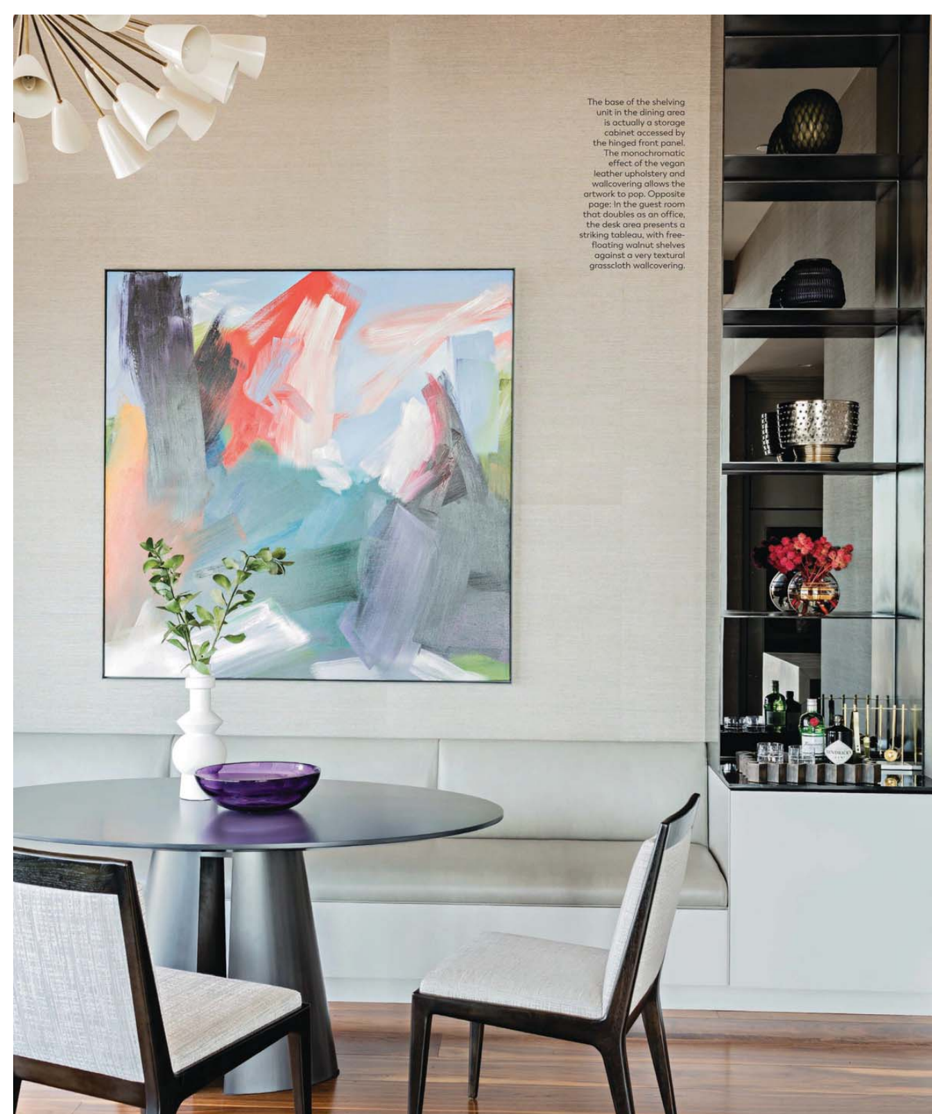
The base of the shelving unit in the dining area is actually a storage cabinet accessed by the hinged front panel. The monochromatic effect of the vegan leather upholstery and wallcovering allows the artwork to pop. Opposite page: In the guest room that doubles as an office, the desk area presents a striking tableau, with free-floating walnut shelves against a very textured grasscloth wallcovering.

based artist Elise Ansel brightens the neutral tableau with broad brushstrokes, while a triptych by Boston-based artist Bill Thompson pulls out corresponding colors. A vintage brass sputnik chandelier with white enamel shades bursts from above. Elms notes, "Pieces from the past inject a new building with a cool vibe."