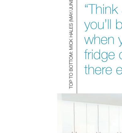
alternative to chrome, and it's a great accent to Statuario and Calacatta marble. It's sleek and modern, without the hardness of matte black plumbing, which doesn't mask water stains." -Jasmine Lam