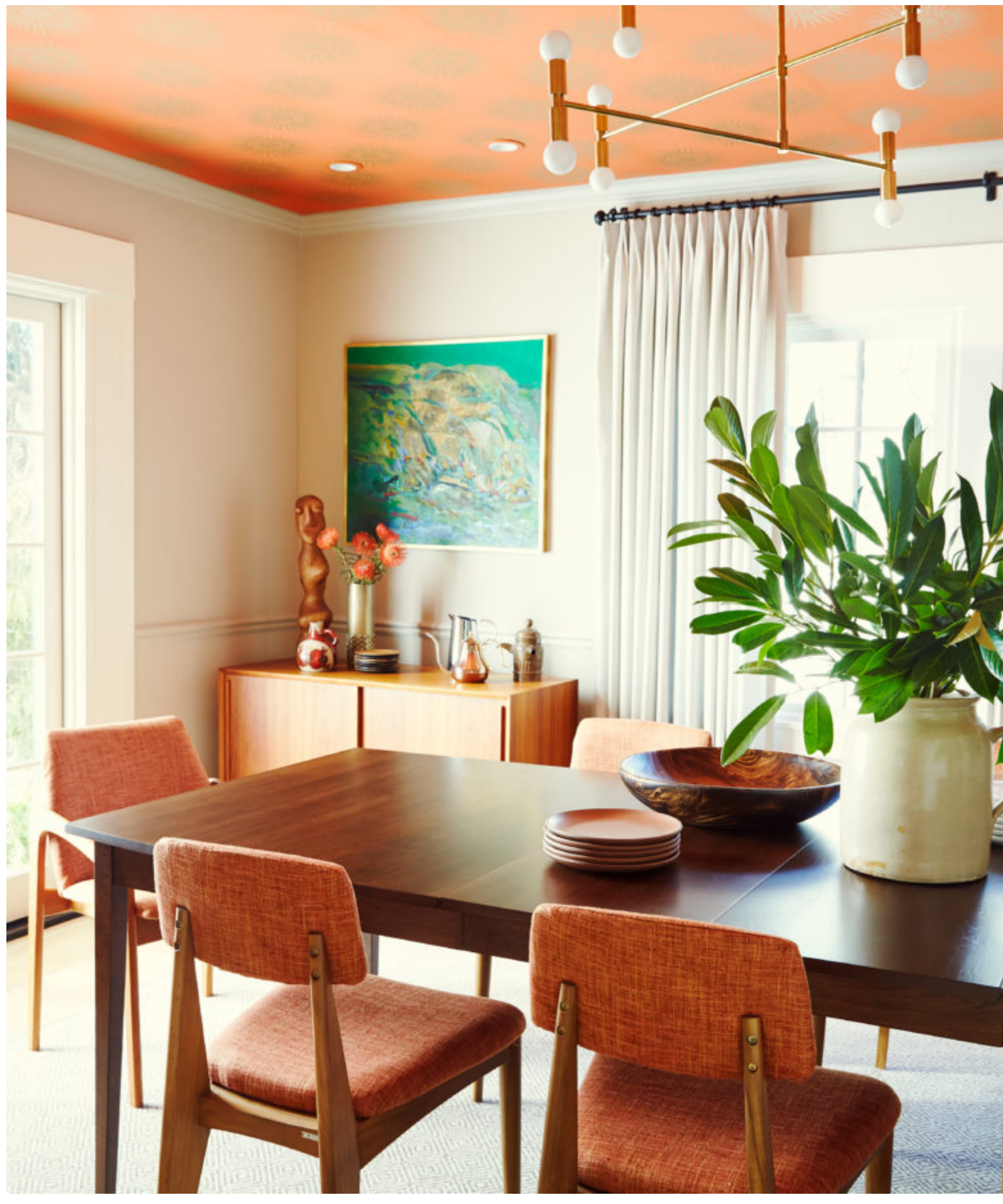
Thibaut wallpaper lines the dining room ceiling. styled by Allegra Hsiao.

From a functional standpoint, they wanted an updated kitchen with a connected dining area," Nystrom says. Not only did they open up the kitchen, they made a big statement with a canary yellow backsplash and cobalt blue cabinets that complement the Terracotta tile. The formal dining room showcases mid-century furniture sitting below a warm, eclectic wallpaper that lines the ceiling.