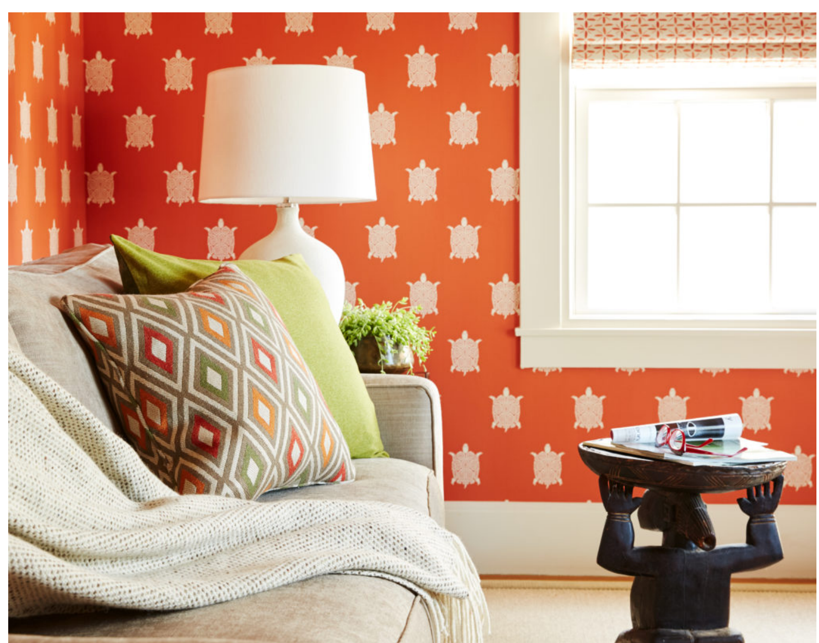
The 'Turtle Room' guest room was inspired by the owners who got married at the Monterey Bay Aquarium in front of the turtle exhibit. Photos by Liz Daly, styled by Allegra Hsiao.