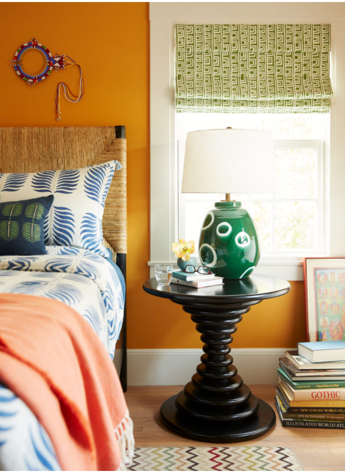
Serena & Lily bedding and side tables from Noir dazzle in the master bedroom.

"They had a number of treasured pieces they wanted incorporated into the new design, including a pair of quirky green sconces that inspired the color scheme of the master bathroom," says Nystrom. The vintage lights are grounded by the designers selections of Fireclay Tile.