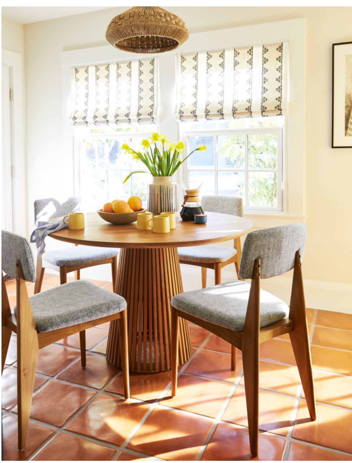
A Selemat pendant hangs over the kitchenette. Photos by Liz Daly, styled by Allegra Hsiao.

To match the family's vibrant personalities, Nystrom adorned the 2,100 square foot Dutch Colonial Single Family Home in the Berkeley Hills with bold color, materials and textures. "Our goal was to design a home that aligned with our clients' personality by striking a balance between old and new, bold and understated," says Nystrom. "Inspired by our clients' treasures and love of color, we strived to create a space that is fresh, modern and wonderfully eclectic."