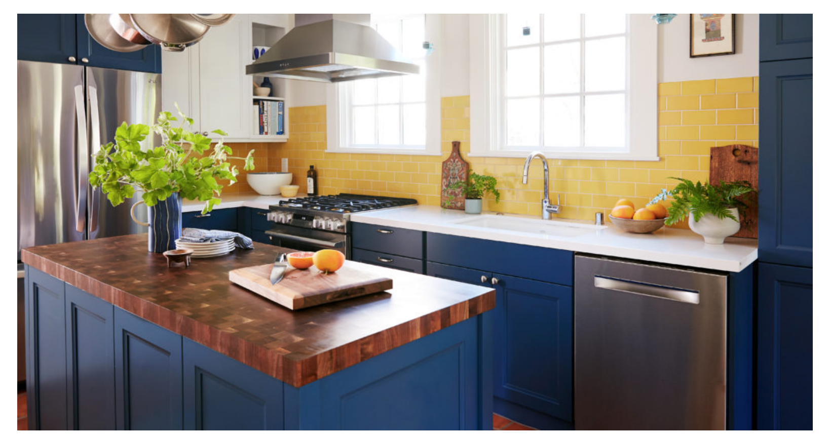
<u>Tuolumne Meadows tile</u> by Fireclay warms up the kitchen. Photos by Liz Daly, styled by Allegra Hsiao.