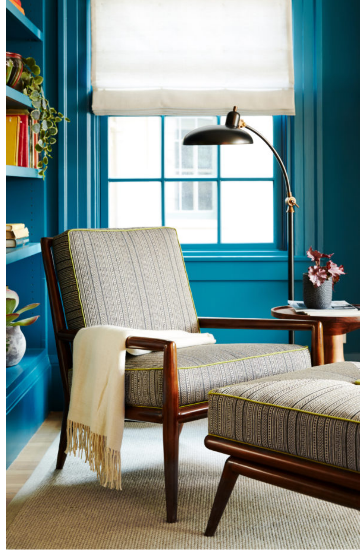
Mid-century furniture grounds the vibrant paint selections. Photos by Liz Daly, styled by Allegra Hsiao.