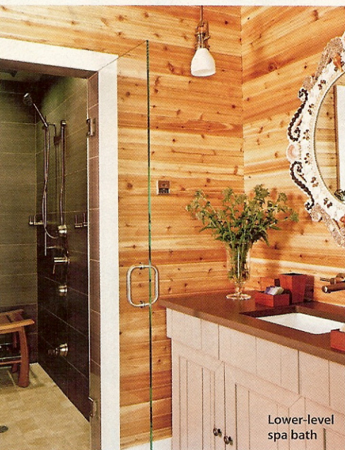
Lower-level spa bath