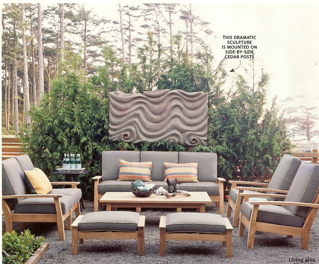
THIS DRAMATIC SCULPTURE IS MOUNTED ON SIDE-BY-SIDE CEDAR POSTS