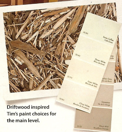
Driftwood inspired Tim's paint choices for the main level.

Sleek styling on the barely-there range hood and the faucet, which can be turned on with just a touch, keeps the focus on form without sacrificing function.