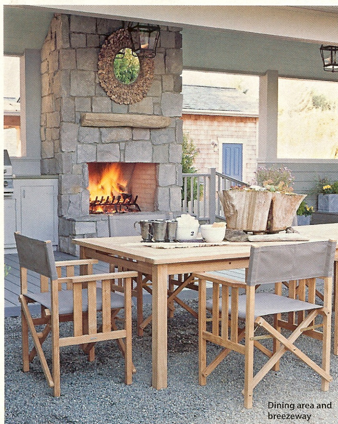
Dining area and breezeway