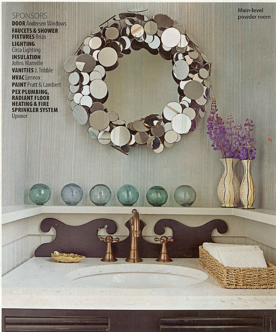
Main-level powder room

"I LIKE TO FILL SMALL SPACES LIKE POWDER ROOMS WITH LOTS OF INTERESTING THINGS TO LOOK AT. THEY'RE LIKE LITTLE SURPRISES FOR GUESTS"