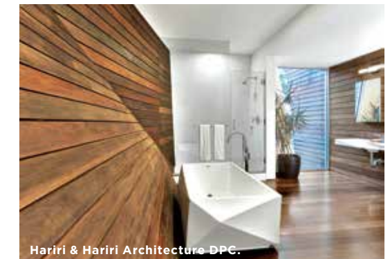
Hariri & Hariri Architecture DPC.