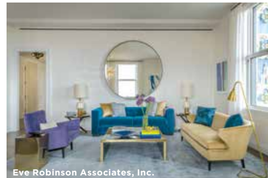
Eve Robinson Associates, Inc.