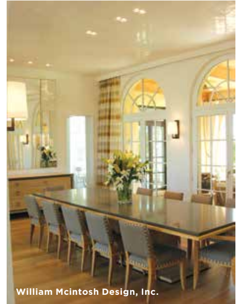
William McIntosh Design, Inc.