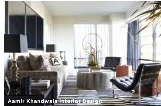
Aamir Khandwala Interior Design

KERRY DELROSE 410 East 59th Street, Suite 1B New York, NY 10022 212.593.8081; delrosedesigngroup.com Trademark: Fresh, chic, contemporary interiors with innovative applications and clean lines