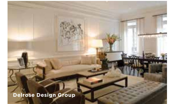
Delrose Design Group