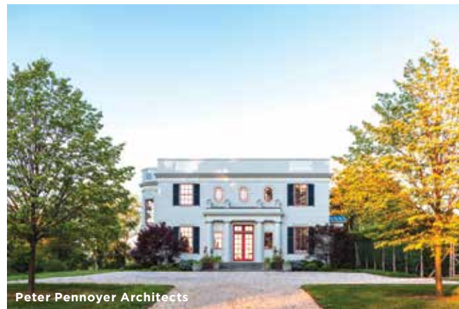
Peter Pennoyer Architects

PETER PENNOYER, FAIA 136 Madison Avenue, 11th Floor New York, NY 10016 212.779.9765; ppapc.com Trademark: Harnessing the classic and translating for the contemporary recall historical sophistication without the pretension