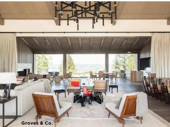
Groves & Co.