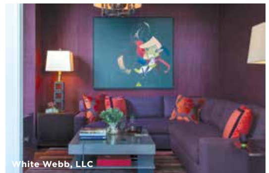
White Webb, LLC