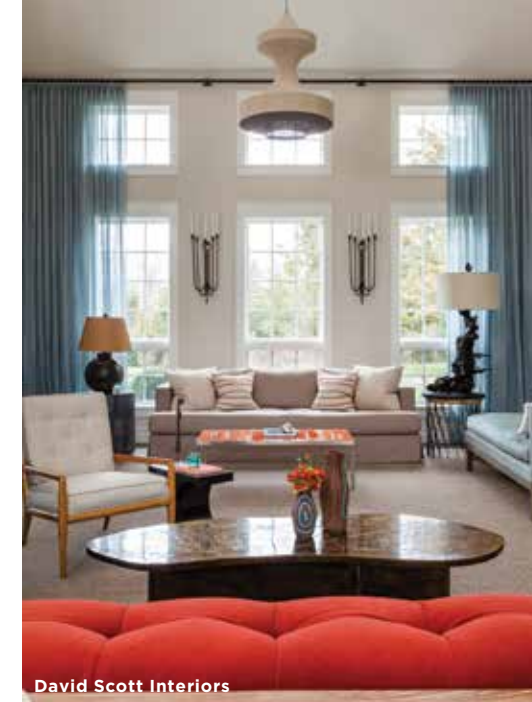
David Scott Interiors

RUSSELL GROVES 210 Eleventh Avenue, Suite 502 New York, NY 10001 212.929.5221; grovesandco.com Trademark: Fresh modern aesthetic with sophisticated materials and luxurious finishes, bringing together the best of contemporary design, comfort and style