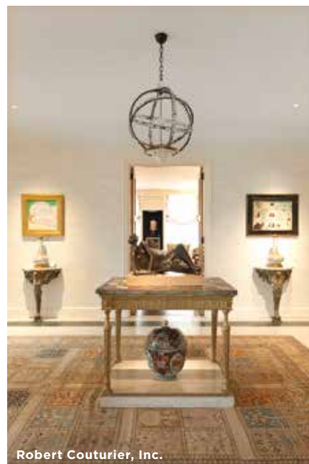
Robert Couturier, Inc.