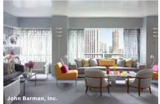
John Barman, Inc.

Trademark: Classically informed, ultra-detailed rooms that enrich daily life with unexpected patterns