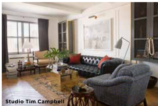
Studio Tim Campbell