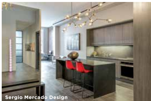
Sergio Mercado Design