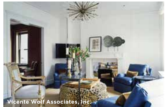
Vicente Wolf Associates, Inc.