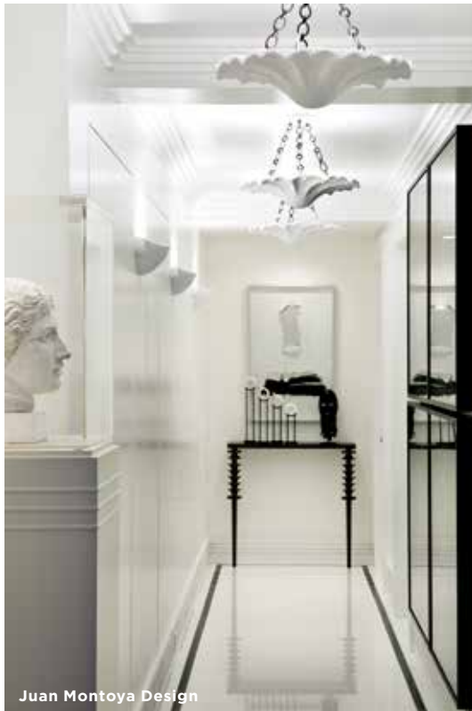
Juan Montoya Design