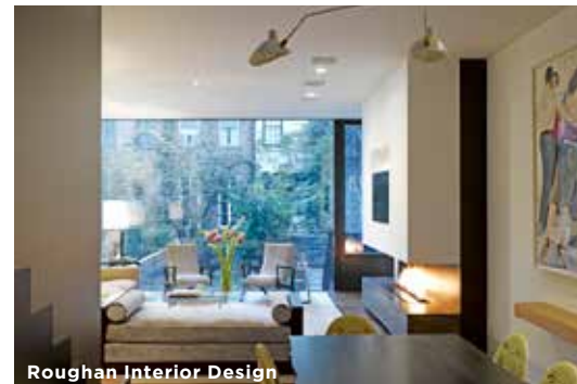
Roughan Interior Design