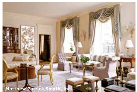
Matthew Patrick Smyth, Inc.