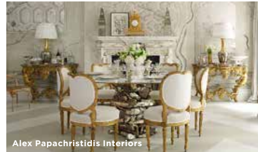
Alex Papachristidis Interiors