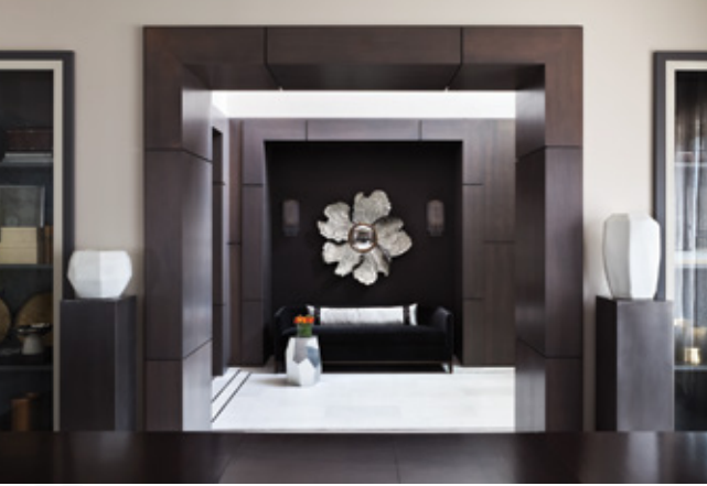
Above: A foyer with custom rift-cut oak wall panels, upholstered fine wool niche panels, glass and brass wall sconces, luxurious mohair sofa and dramatic Laura Kirar mirror Left: Modern sensibility is achieved through clean lines, captivating light fixtures and muted hues

need to have concise, factual, wellorganized documents summarizing the information they need to make an informed decision," says Metcalfe. They take on this role with passion, reverence and dedication.