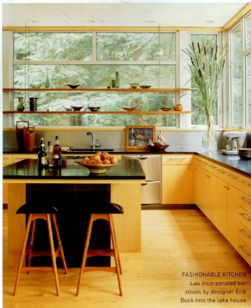
FASHIONABLE KITCHEN Lau incorporated bar stools by designer Erik Buck into the lake house.