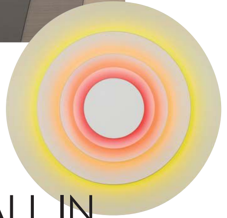
Marsat Concentric Sconce in Corona. www.abchome.com