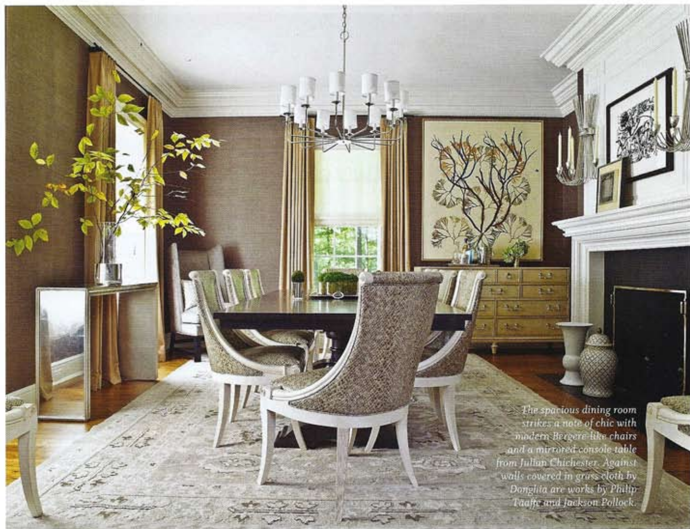
The spacious dining room strikes a note of chic with modern Bergere-like chairs and a mirrored console table from Julian Chichester. Against walls covered in grass cloth by Donghia are works by Philip Taaffe and Jackson Pollock.