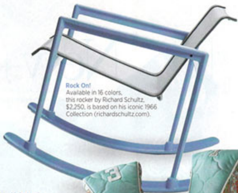
Rock On! Available in 16 colors, this rocker by Richard Schultz, $2,250, is based on his iconic 1966 Collection (richardschultz.com).

Maybe they're both right. After all, sipping and summer afternoons go together like sunscreen and beaches. Whatever your travel or stay-at-home style, we've scouted finds to help you make the most of these lazy, hazy days. Believe it or not, each fabric swatch and furnishing shown is made of weather-worthy material—even the striking metallic architectural elements, below .