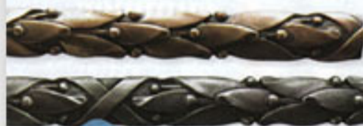
Decorative Relief Nine metallic finishes make these elegant moldings tolerant of all weather; Enkeboll (enkeboll.com).