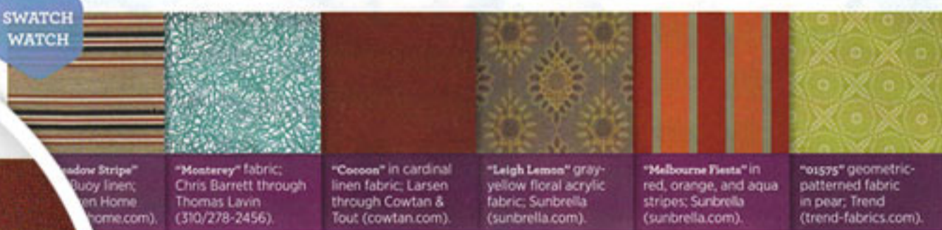
"Shadow Stripe" in navy linen; Traditional Home (traditionalhome.com).