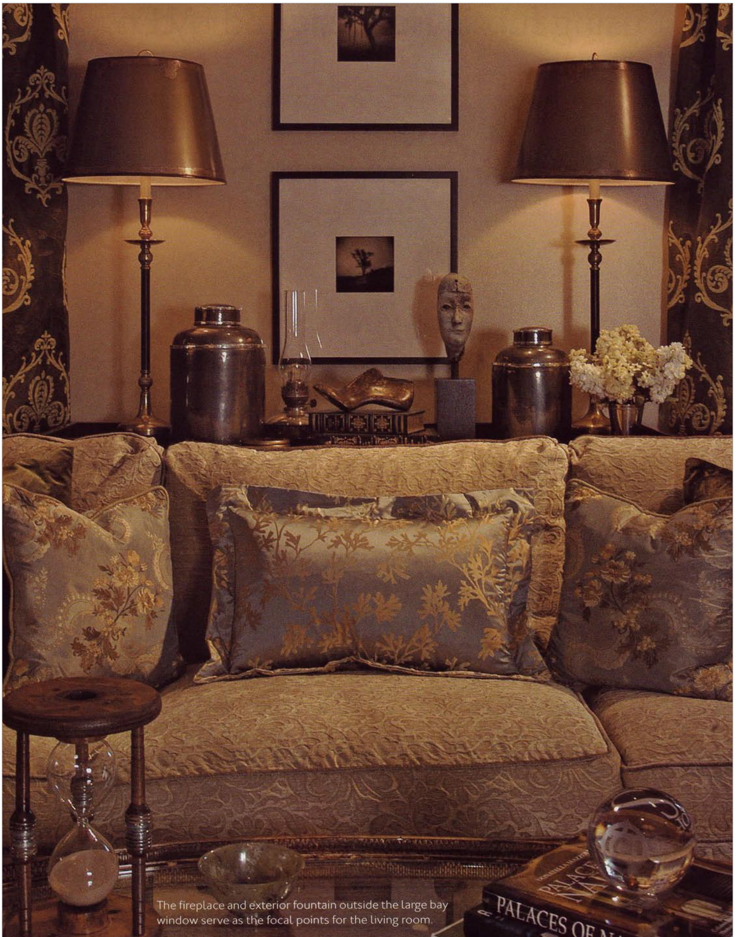
The fireplace and exterior fountain outside the large bay window serve as the focal points for the living room.