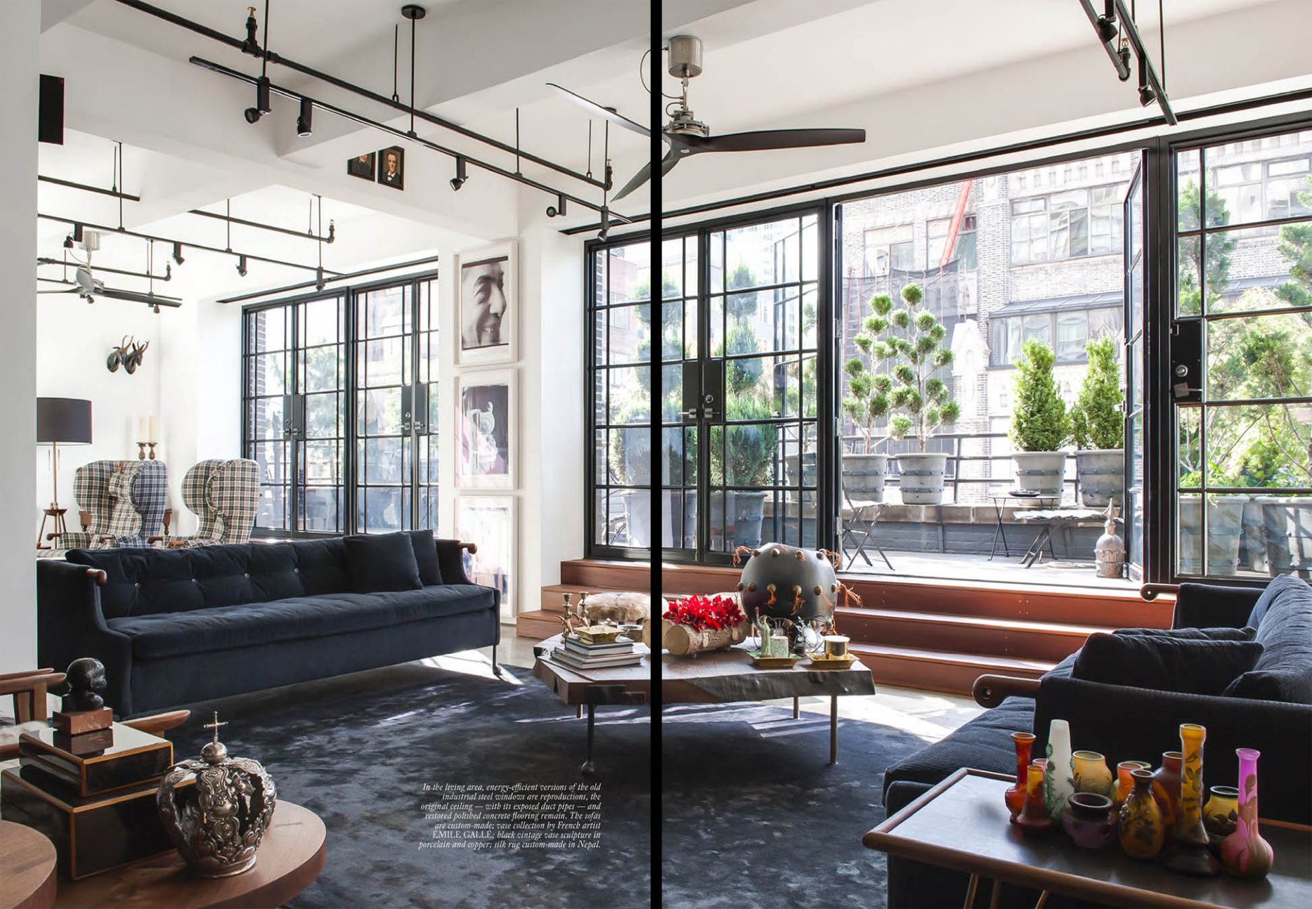
In the living area, energy-efficient versions of the old industrial steel windows are reproductions, the original ceiling — with its exposed duct pipes — and restored polished concrete flooring remain. The sofas are custom-made; case collection by French artist EMILE GALLE; black vintage case sculpture in porcelain and copper; silk rug custom-made in Nepal.