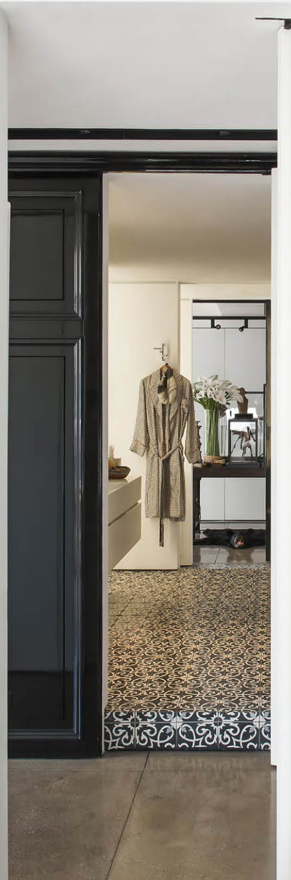
The main ensuite features lack-and-white tiles made in Fez, Morocco, and custom sink and fixtures. The artwork by the entrance is by Luxembourg artist CHRISTIAN MOSAR.