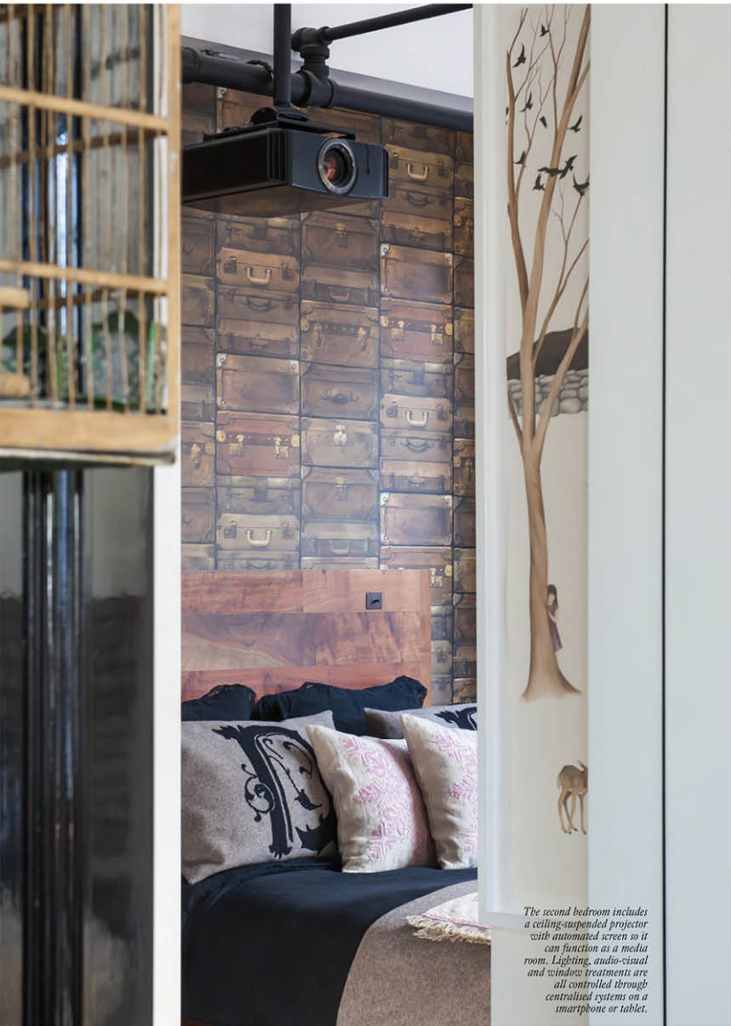
The second bedroom includes a ceiling-suspended projector with automated screen so it can function as a media room. Lighting, audio-visual and window treatments are all controlled through centralised systems on a smartphone or tablet.