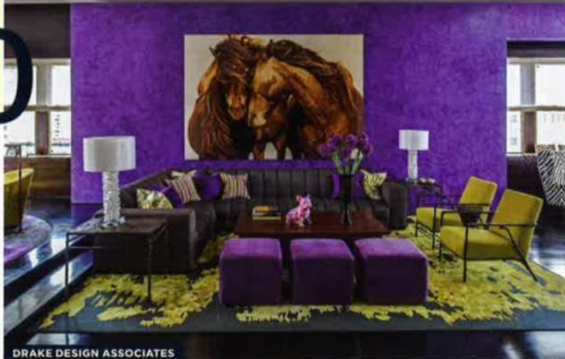
DRAKE DESIGN ASSOCIATES