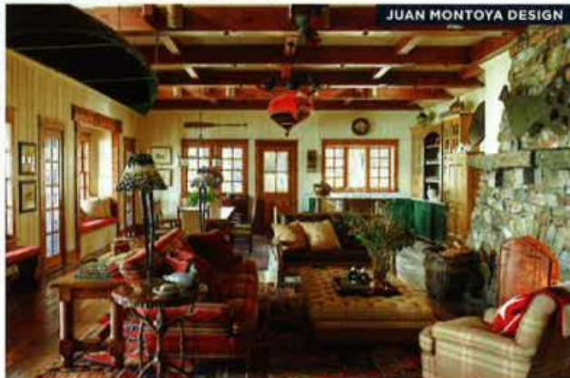
JUAN MONTOYA DESIGN

TRADEMARK: Design with a singular, transformative point of view that makes the classic modern and the modern classic