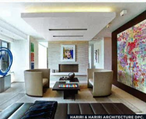
HARIRI & HARIRI ARCHITECTURE DPC.

TRADEMARK: Multicultural, worldly interiors marked by refinement, sophistication, and elegance