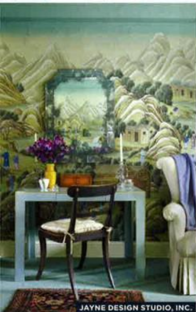
JAYNE DESIGN STUDIO, INC.