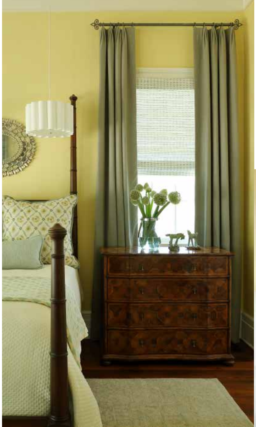
Sunny Suite The master suite's cheerful yellow palette was inspired by the wife's request for a "bright and happy" room. The sunny hue continues into the master bath, where a geometric textile by Stroheim adds a pop of pattern. opposite A private seating area in the master suite features a limestone fireplace by Francois & Co. and offers Cheryl a quiet place to read or knit.