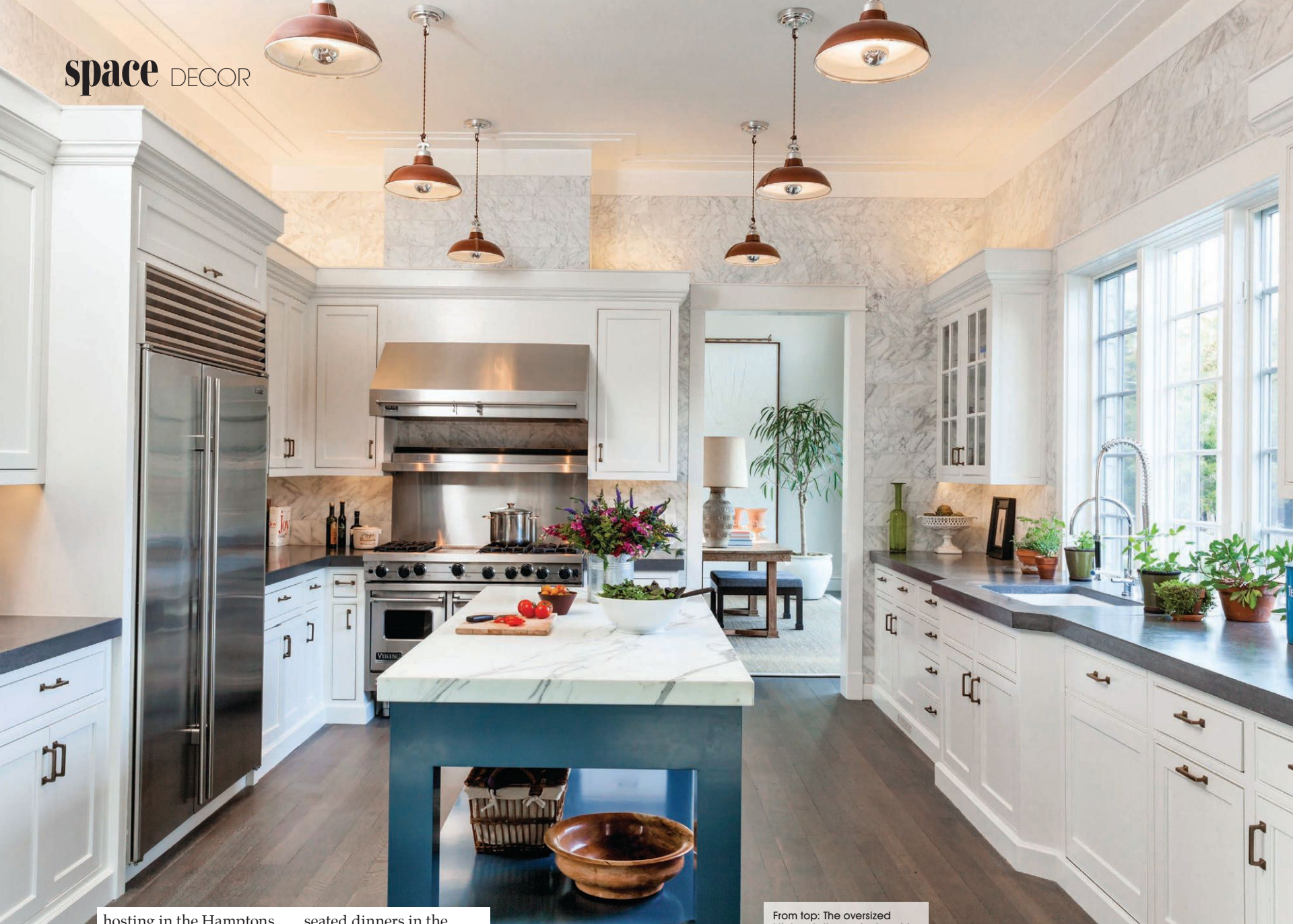
From top: The oversized kitchen is the perfect spot for entertaining multiple guests; conversational seating.