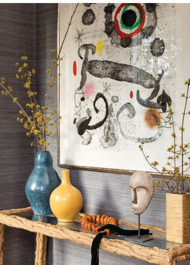
Clockwise from top left: Kelvin LaVerne table; intimate seating in the dining room; signature accents fill the home; in the living space, midcentury chairs flank Scott's signature cocktail table; color and art are essential elements.