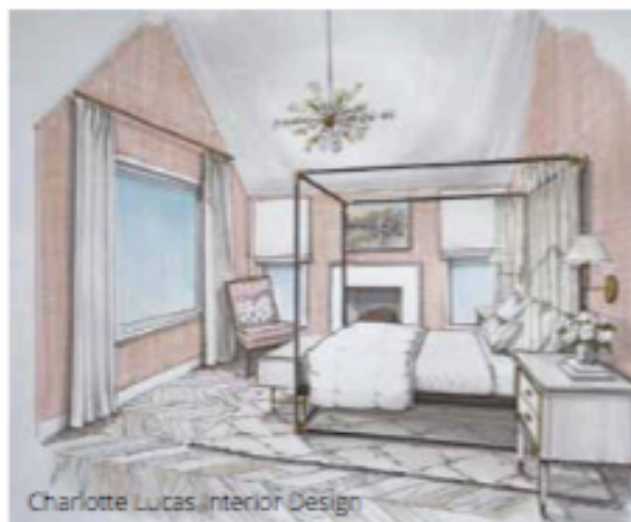
Charlotte Lucas Interior Design