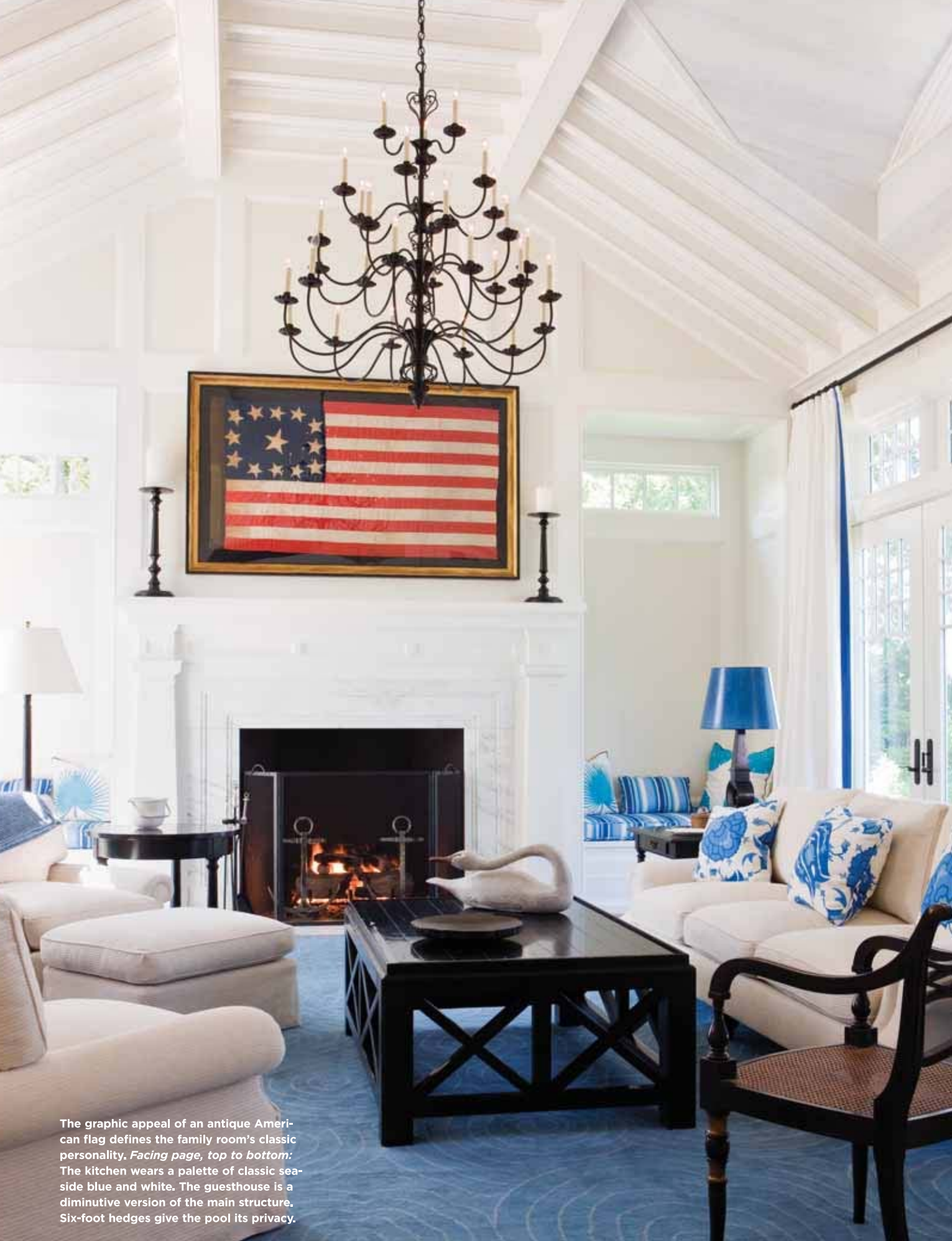
The graphic appeal of an antique American flag defines the family room's classic personality. Facing page, top to bottom: The kitchen wears a palette of classic seaside blue and white. The guesthouse is a diminutive version of the main structure. Six-foot hedges give the pool its privacy.