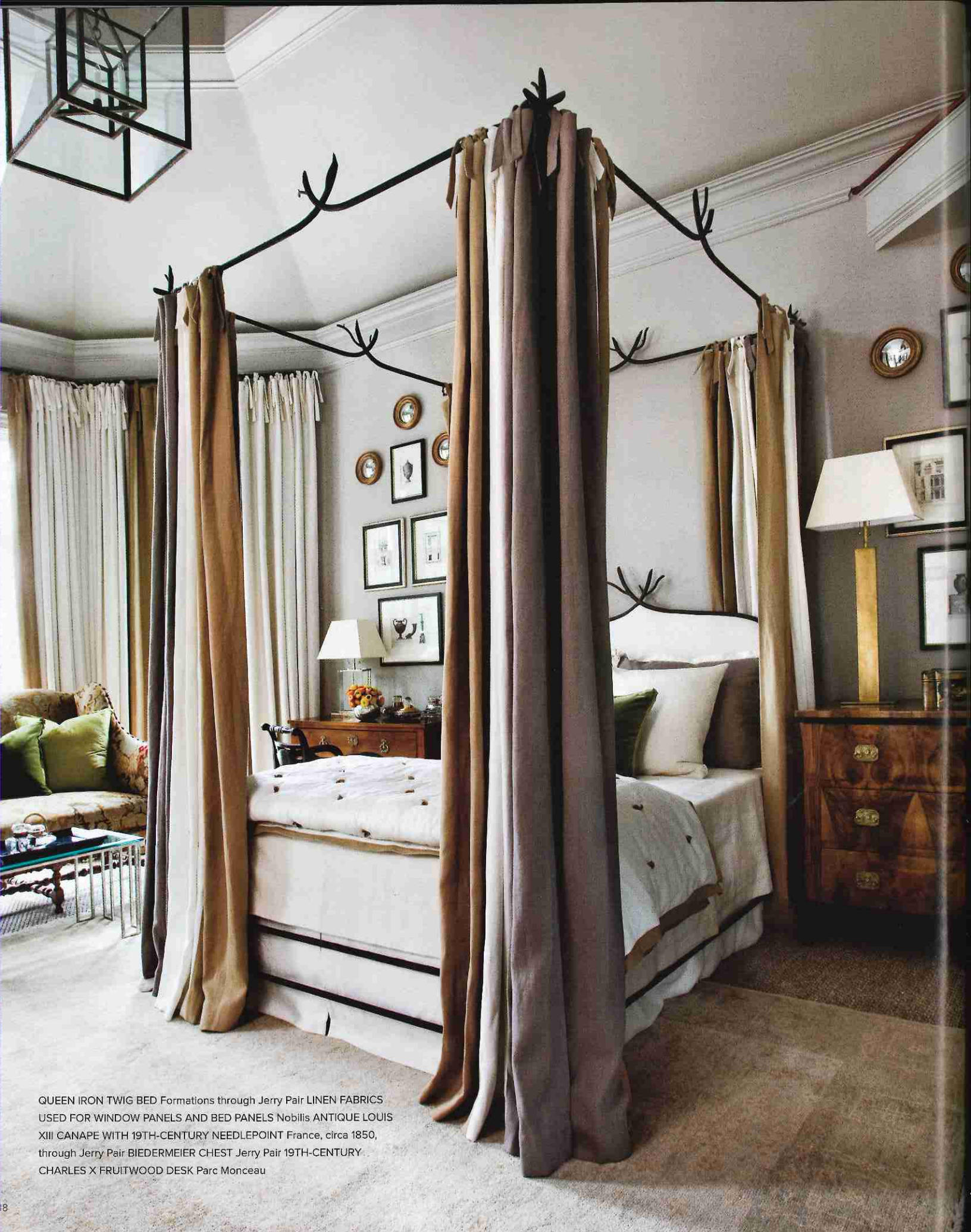
QUEEN IRON TWIG BED Formations through Jerry Pair LINEN FABRICS USED FOR WINDOW PANELS AND BED PANELS Nobilis ANTIQUE LOUIS XIII CANAPE WITH 19TH-CENTURY NEEDLEPOINT France, circa 1850, through Jerry Pair BIEDERMEIER CHEST Jerry Pair 19TH-CENTURY CHARLES X FRUITWOOD DESK Parc Monceau