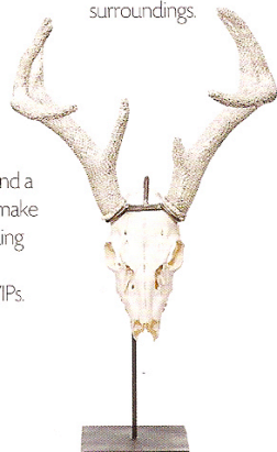
A Swarovski-encrusted, mounted deer skull adds mystery and glam to your surroundings.