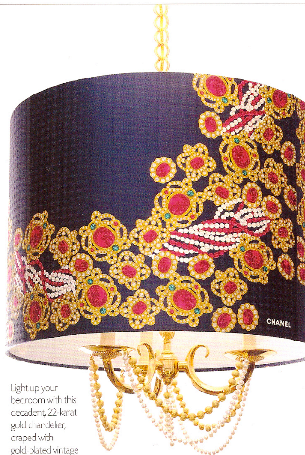
Light up your bedroom with this decadent, 22-karat gold chandelier, draped with gold-plated vintage beads, chains and real pearls.

Reinvent your space with personality. The Bespoke Vintage Designer Scarf ottoman pushes the limits of modernity as it stands on Lucite legs.