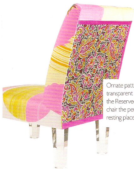
Ornate patterns and a transparent strut make the Reserved Seating chair the perfect resting place for VIPs.