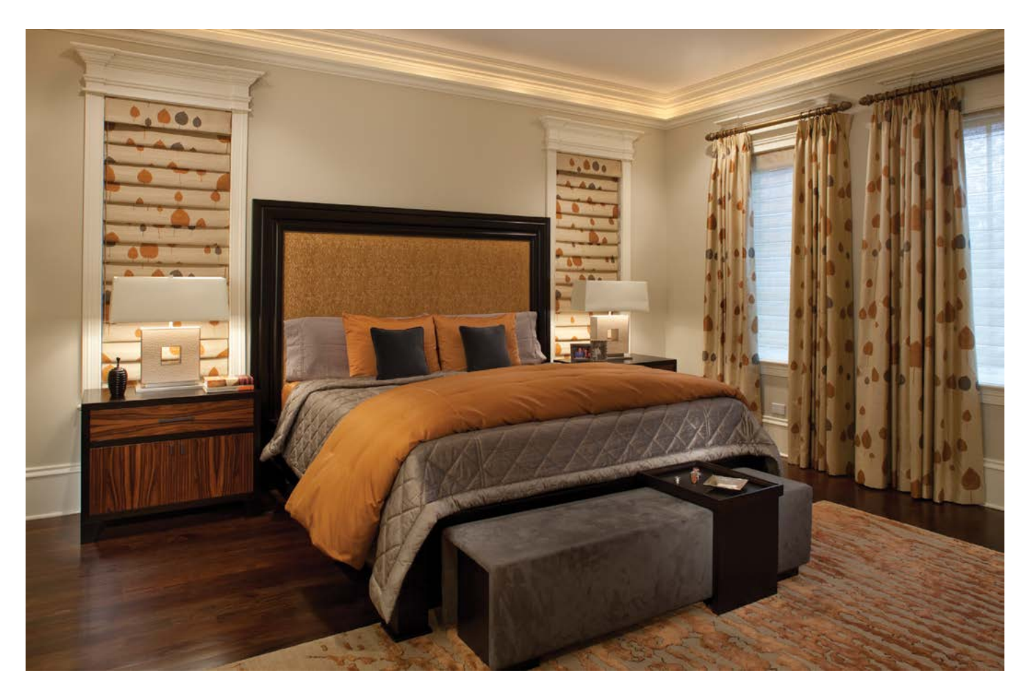
oldsymbol{\uparrow} Pretty in pumpkin, this bedroom suite features a custom headboard, Roman shades and coordinating curtains. The Kenmore Avenue residence in Chicago further utilized rugs, furniture, pillows and accessories to complete this definitive savvy design.

Whether designing, building remodeling a bedroom suite, it is crucial to spend time contemplating what aspects are most important to you personally. Consider the functionality and design preferences you desire your space to achieve.