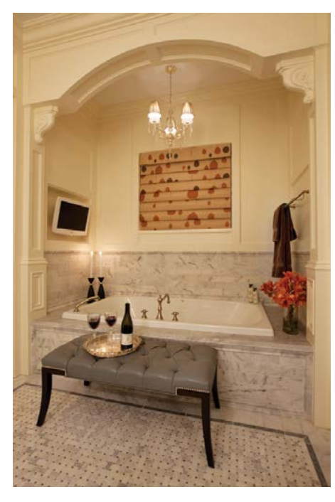
↑ The Kenmore Avenue residence boasts a romantic setting and interesting architectural archways and coordinating corbels. An overhead chandelier offers beautiful lighting for this exquisite bath space.