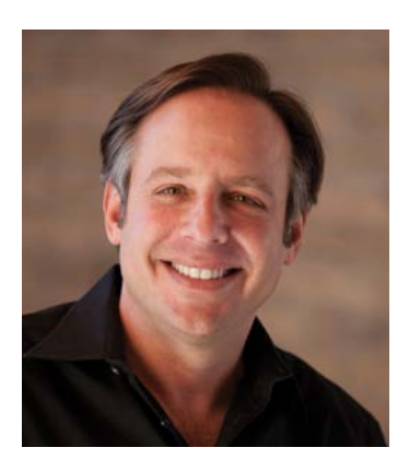
\boldsymbol{\upLehal} "Choosing soothing colors helps to create a more relaxing bedroom atmosphere, while including textures and incorporating a variety of materials add interest." Michael Abrams

Soothing, tranquil, peaceful private—your personal bedroom sanctuary awaits. Now, close your eyes. Sweet dreams. Good night! *