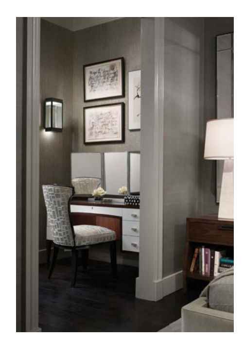
↑ The Merchandise Mart's 2011 Dream Home vanity and desk area within the master suite continues the color scheme with framed artwork, angled mirrors and black sconce lighting accents.

to life personal preferences. "Choosing soothing colors helps to create a more relaxing bedroom atmosphere,