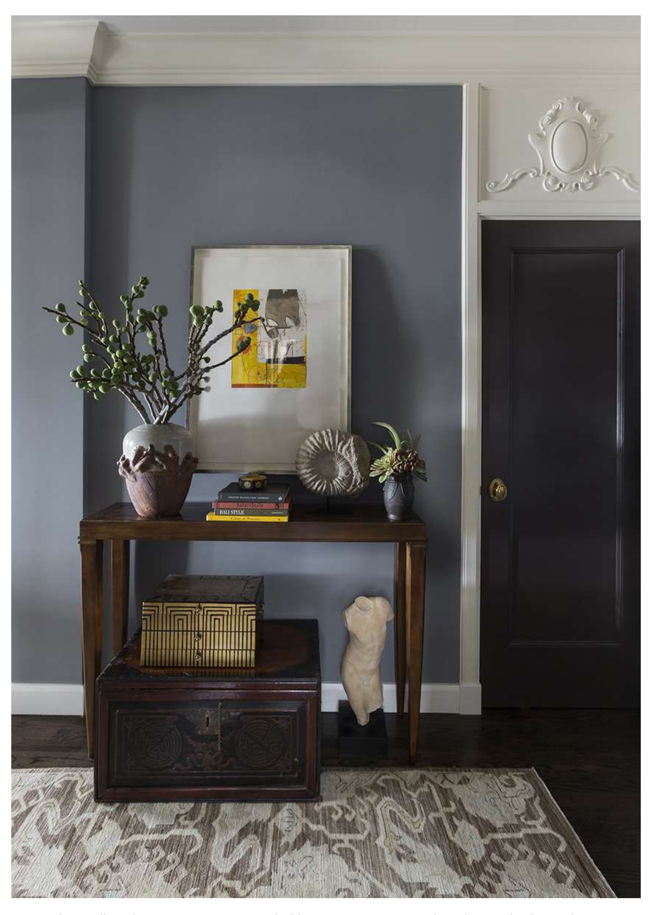
White walls in the entryway were painted a blue grey to create immediate drama. The doors, also originally white were painted with Benjamin Moore's Graphic paint to complement the dark doors. The console table is from Hickory Chair and the Khotan rug is from Stark. The trunk is an Asian antique and the art is by Dolby Chadwick.