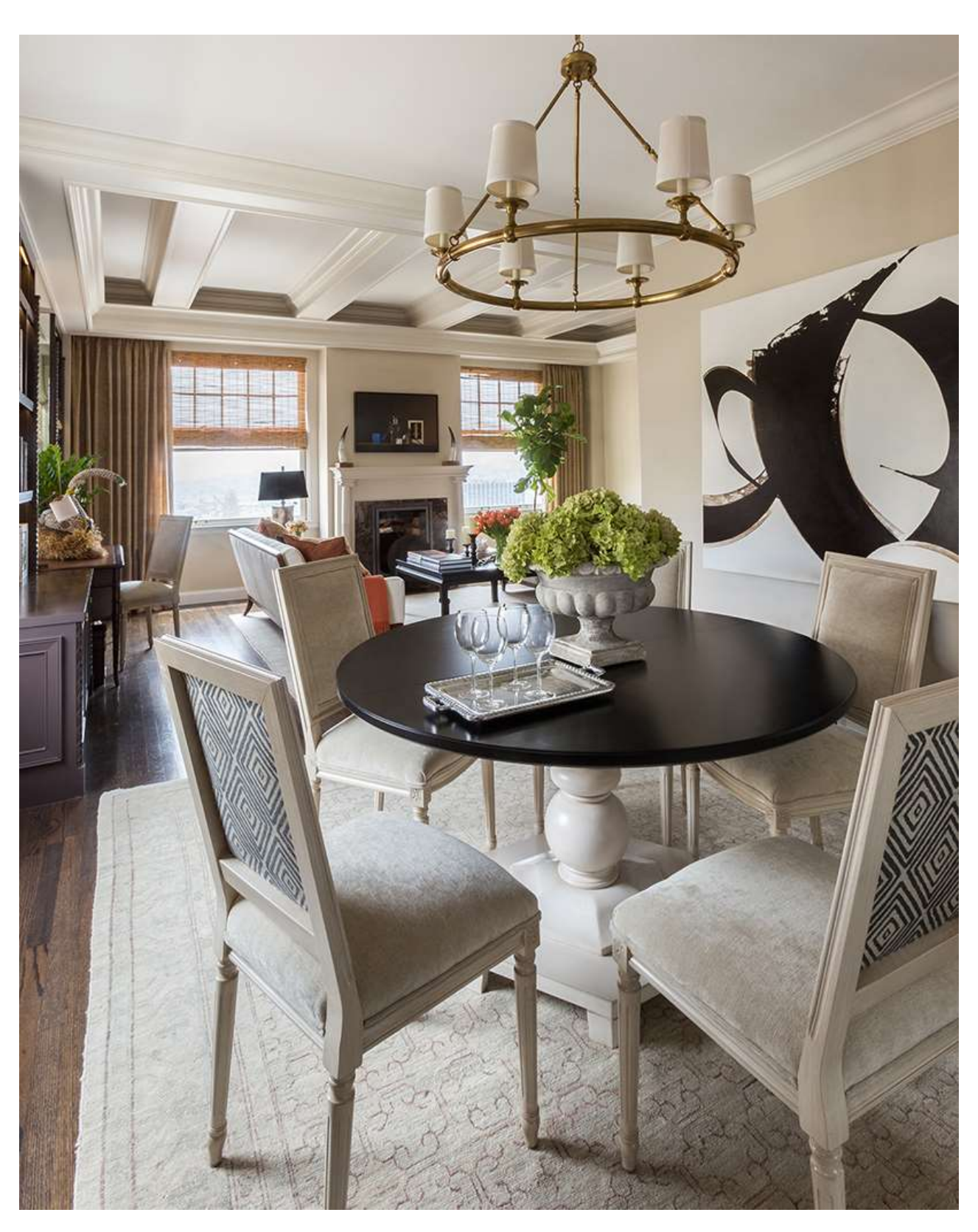
A round dining table seats six and works perfectly in the square-sized dining space. The chandelier is from Circa Lighting and the painting is by Charley Brown from Dolby Chadwick.

The walls in the den were painted a dark navy to create a sense of coziness while the large Asian screen behind the sofa lends a sense of drama to the small space. A coffee table was created by placing two Chinese benches side by side. The sofa bed is from Pearson and the adjacent side tables are from Oly with lamps from Circa Lighting. A chair from Lee Industries is covered in a pale acid green faux-suede and sits next to a small round table from Global Views.