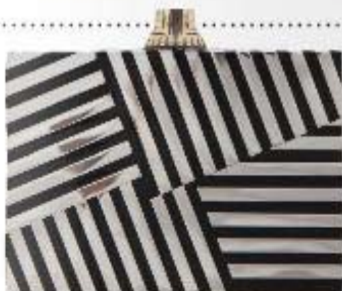
Fractured Clutch Fully functional as an evening bag, this structured clutch also acts as sculpture on a shelf when not in use. $795