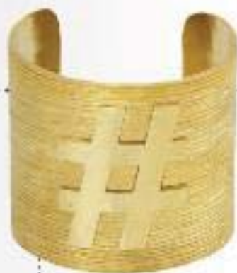
Maverick Cuff An of-the-moment hashtag symbol adorns this 22-karat gold-plated bronze bracelet. $325