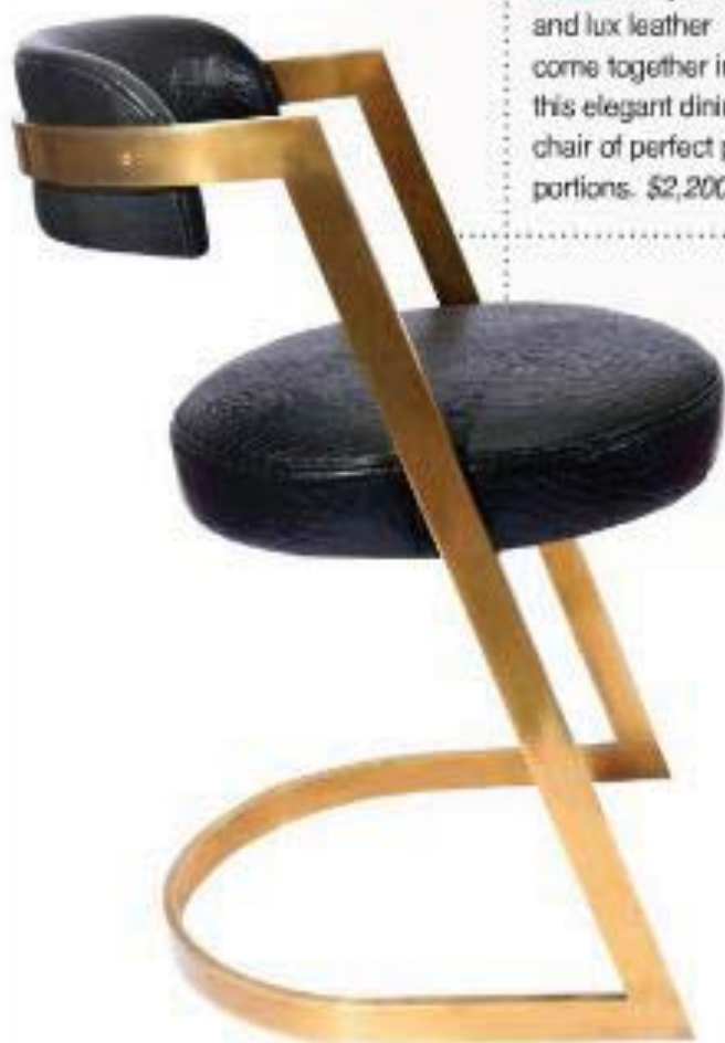
Studio Dining Chair Shiny bronze and lux leather come together in this elegant dining chair of perfect proportions. $2,200