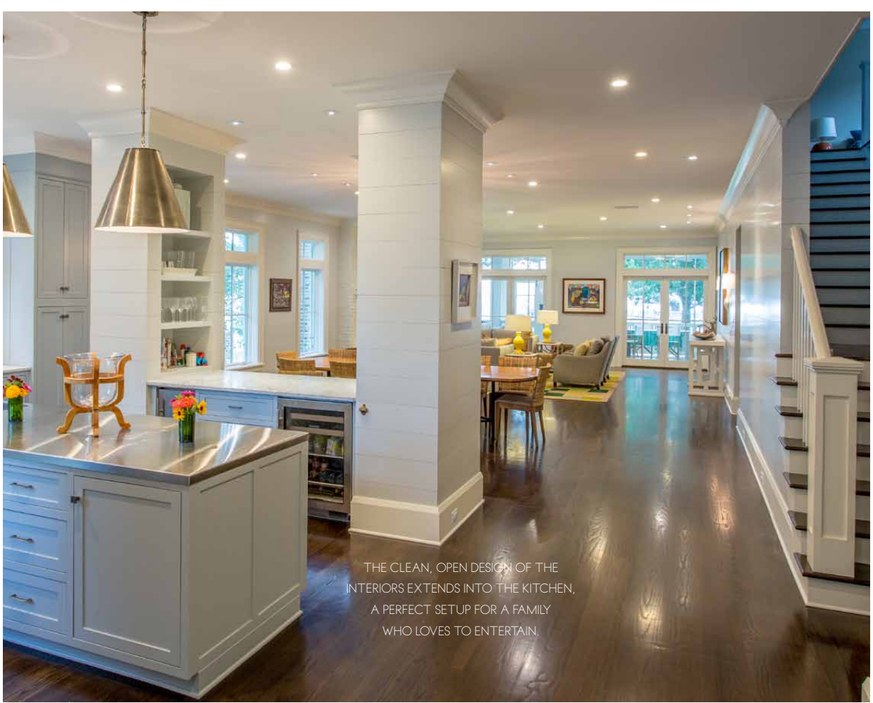
THE CLEAN, OPEN DESIGN OF THE INTERIORS EXTENDS INTO THE KITCHEN, A PERFECT SETUP FOR A FAMILY WHO LOVES TO ENTERTAIN.