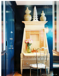
141 Home | INTERIOR DESIGN | 2015