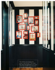
140 Home | INTERIOR DESIGN | 2015