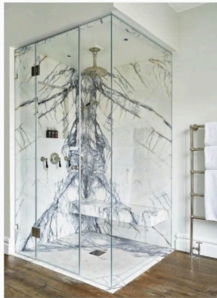
ABOVE Beautifully bookmatched lilac-toned marble creates a dramatic impact in the luxurious steam shower.

WORDS: LINDA CLAYTON