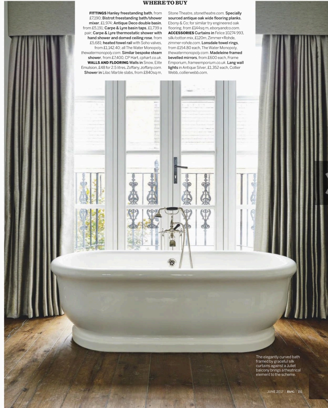
The elegantly curved bath framed by graceful silk curtains against a Juliet balcony brings a theatrical element to the scheme.

Stone Theatre, stonetheatre.com . Specially sourced antique oak wide flooring planks , Ebony & Co. for similar try engineered oak flooring, from £144sq m, ebonyandco.com . ACCESSORIES Curtains in Felice 10274 993, silk/cotton mix, £120m, Zimmer+Rohde, zimmer-rohde.com . Lonsdale towel rings , from £154.80 each, The Water Monopoly, thewatermonopoly.com . Madeleine framed bevelled mirrors , from £600 each, Frame Emporium, frameemporium.co.uk . Lang wall lights in Antique Silver, £1,352 each, Collier Webb, collierwebb.com .