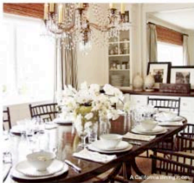
A California dining room.

antiques (an 18th-century French chest of drawers, a 19th-century Chinese chair), vintage pieces by blue-chip names, and striking modern art. katieilydon.com .