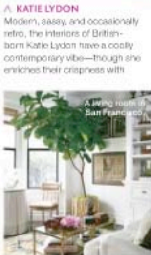
A living room in San Francisco.

style. Her serene rooms are dappled with discreet pops of color, Hollywood Regency accents, and intriguing custom-made furniture. melledesign.com .