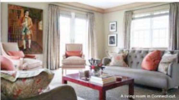
A living room in Connecticut.

You may not have heard of them yet, but these five young talents are already creating rooms that are superstylish—and distinctively their own