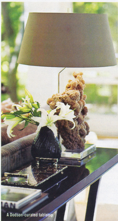
A Dodson-curated tabletop

The artist you'd design a room around. I love Claire Sherman's Moss (2010). I'd use it in a navy-lacquered study with navy velvet upholstery and an Ikat rug.