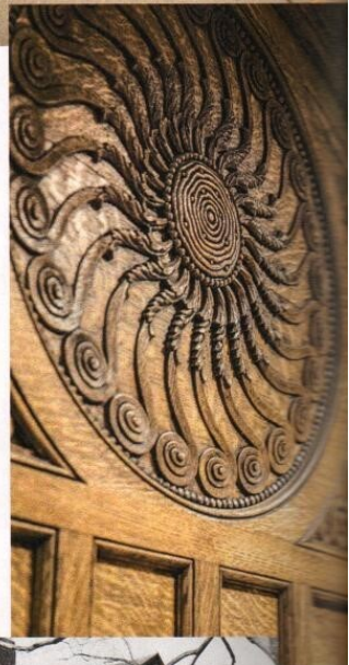
▶ The carved-oak fireplace medallion was in very bad shape. Planeta restored it to its former glory and stained it to match the original color.