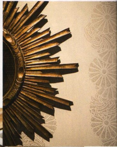
▶ Detail of an antique Spanish gilt-wood sunburst mirror from 1stdibs in the living room.