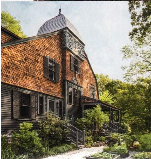
The house was designed in 1883 by Boston architects Peabody & Stearns. In keeping with its Shingle Style construction, each shingle was manipulated and deployed as decoration. The first owner, a railroad executive, had many neighbors who were doctors; this area of Brookline is affectionately known today as Pill Hill.