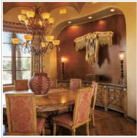
Boasting a coppery "umbrella" ceiling, the dining room glows with a warm, desert-inspired palette. To better showcase the Native American leather dress, the niche was painted with a textured copper finish.

With hobbies that include golf, flying and car racing, the homeowners admit that they don't sit still very long. But when they do, their desert dwelling provides the comfort, privacy and relaxed Arizona lifestyle they had envisioned—a place to gather family and friends and make memories. "Kim really took the home to a different level, making it warm, comfortable and very user-friendly," notes the lady of the house. "We feel very fortunate to come home to our own special and private resort—how wonderful is that?"