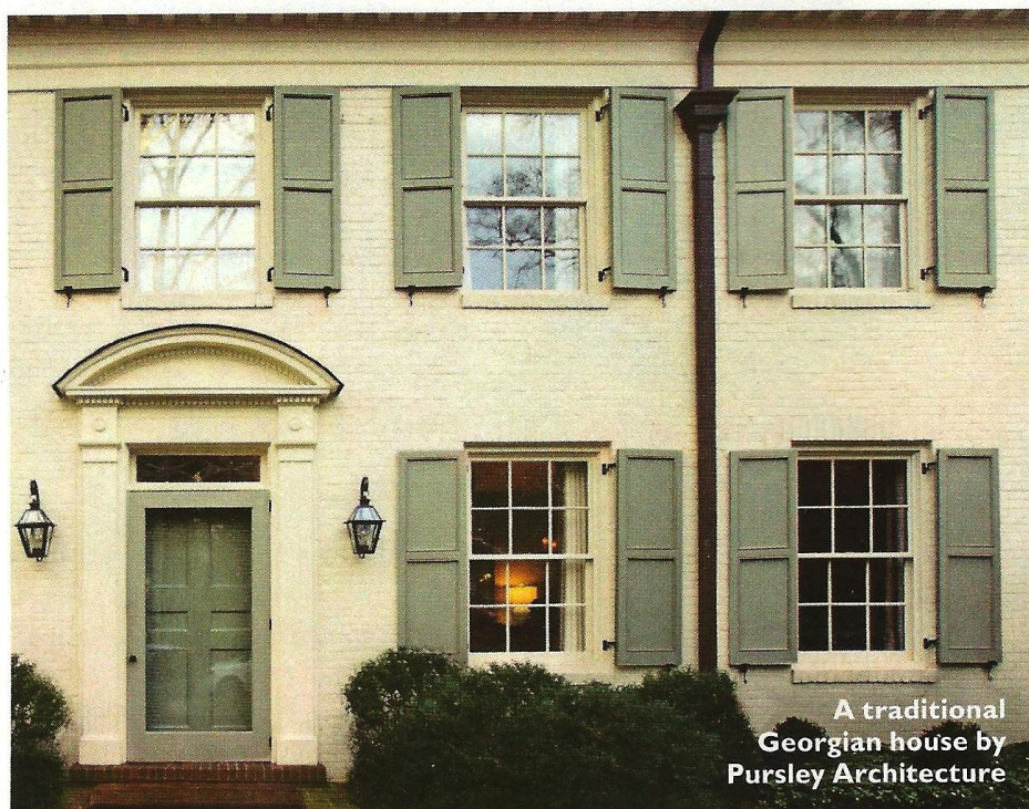
A traditional Georgian house by Pursley Architecture

TRIM Outside White (CW712); prattandlambert.com