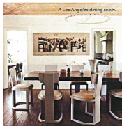
A Los Angeles dining room.