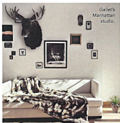
Gallet's Manhattan studio.

earn a master's degree in architecture (his first venture out of school was working on the redesign of the World Trade Center site). His tactile approach—he starts each project by assembling fabric boards, as though designing clothing—is clearly rooted in his fashion background. architectureaslarge.com