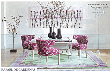
A sitting area in a Park Avenue apartment.

THESE UP-AND-COMING TALENTS HAVE ALREADY ESTABLISHED SIGNATURE APPROACHES TO STYLE