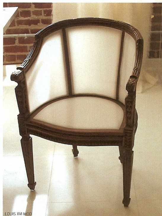
LOUIS XVI MOD