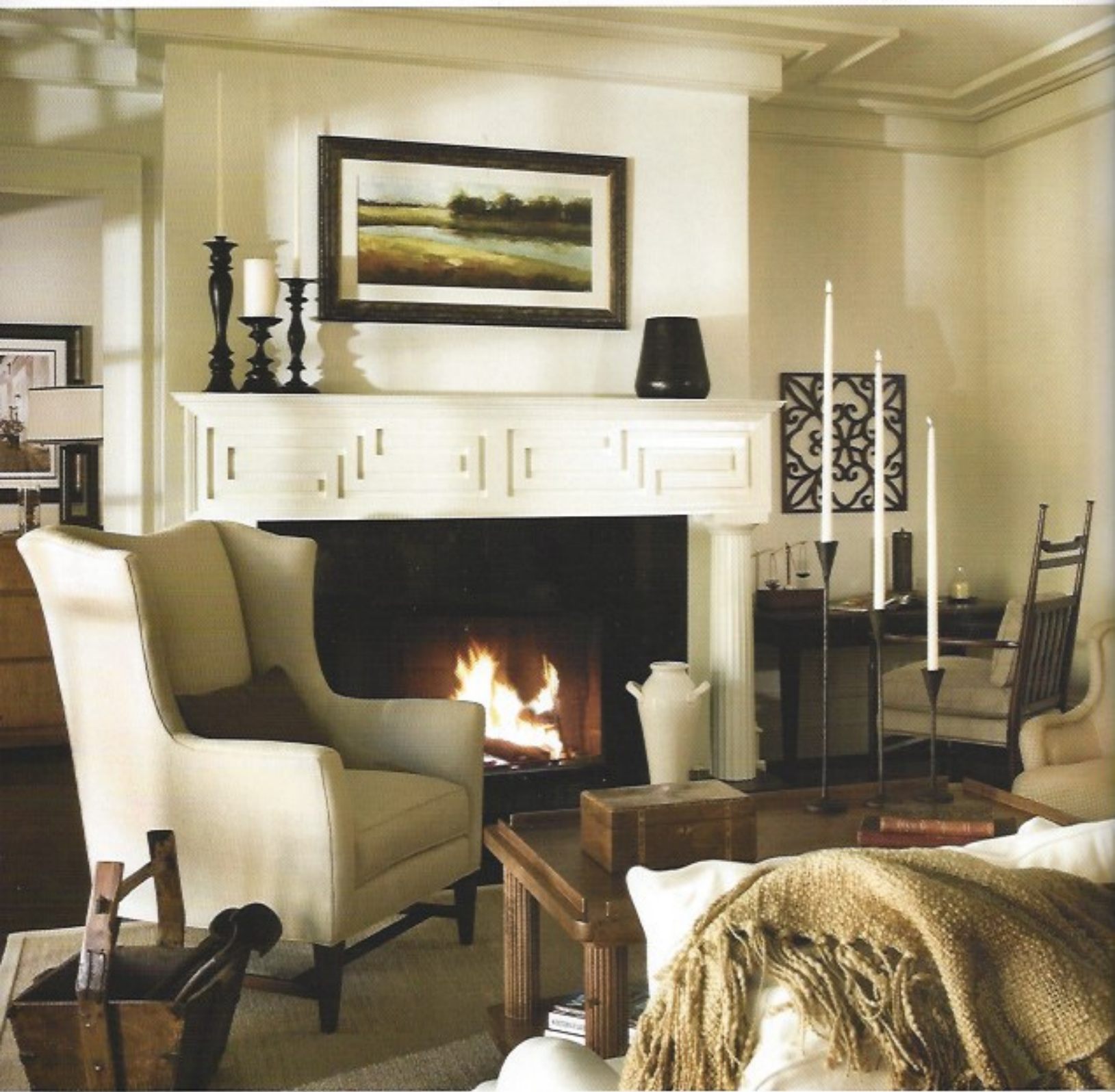
The open great room is anchored by a cozy fireplace and exudes a lovely blend of distinctive architecture and modern convenience—perfect for everyday living as well as entertaining.