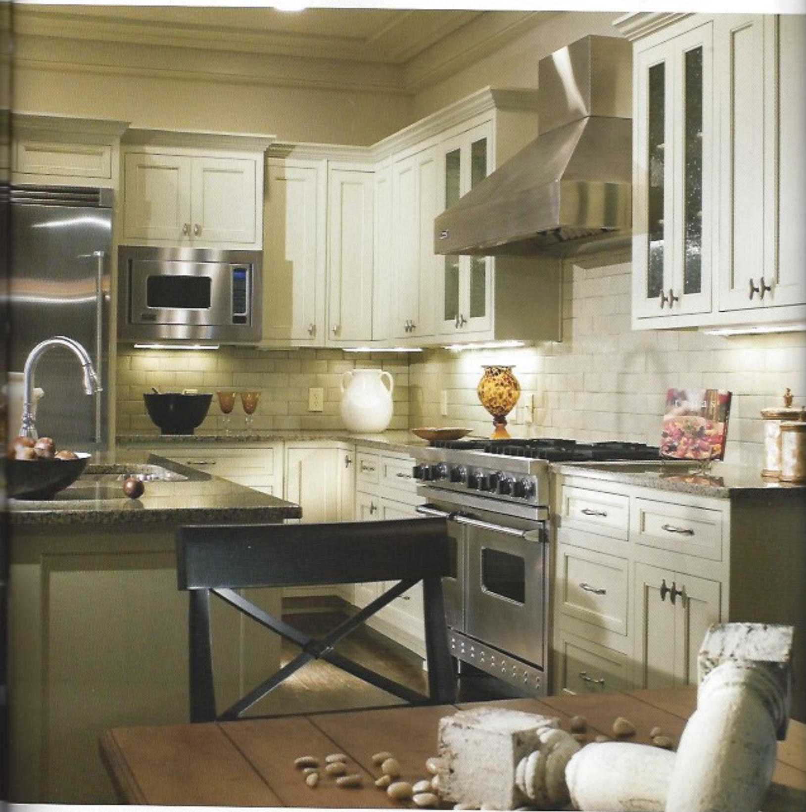
A beautiful gourmet kitchen features a large breakfast bar with granite countertops and stainless steel appliances. Raised floor cabinetry provides a furniture-quality feel while seeded glass in the cabinet doors lends a layer of texture and maturity. ♦