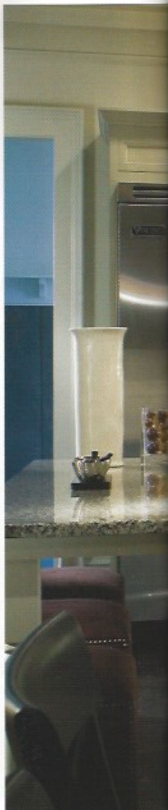
Sharing the open space of the kitchen is a sunny breakfast room. The ebony-stained oak floors were hand-sanded to provide a broader sense of depth and seasoning.