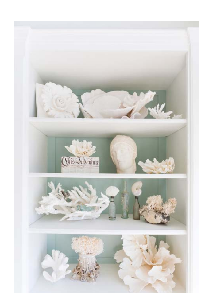
"My style is not limited to a particular genre, I approach design with the understanding that there are no boundaries..."