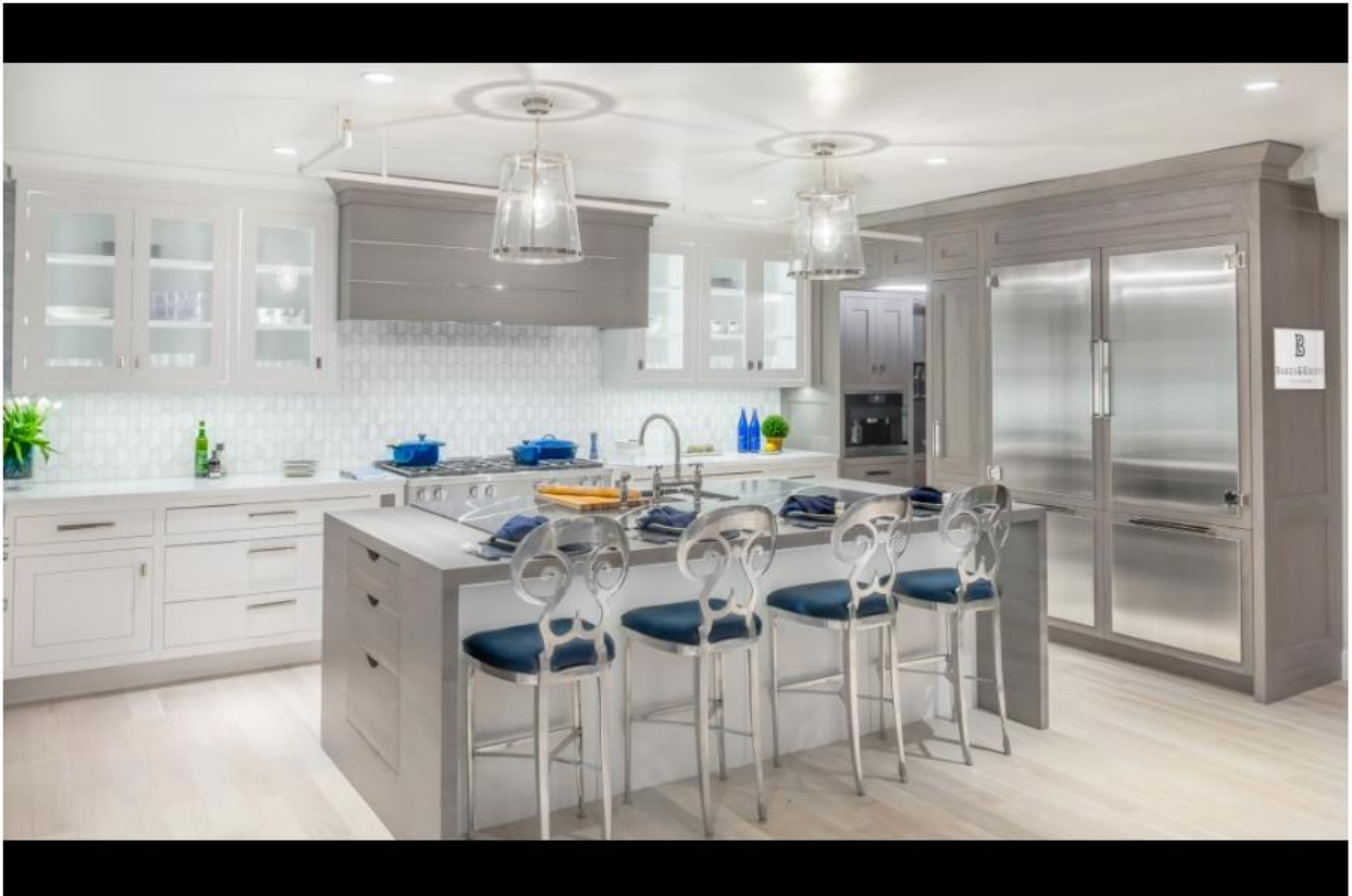
The kitchen by Bakes & Kropp features the luxury custom cabinetry designers' new transitional style collection, Revelane, which blends new and old. The quartz countertops have a marble-like finish, and the appliances are by Miele.