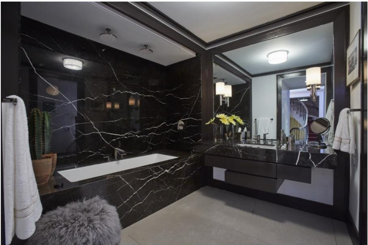
The third-floor "His" bathroom, by Scarpidis Design, has a masculine look and a bathtub with double showerheads. The fixtures are by Kohler.