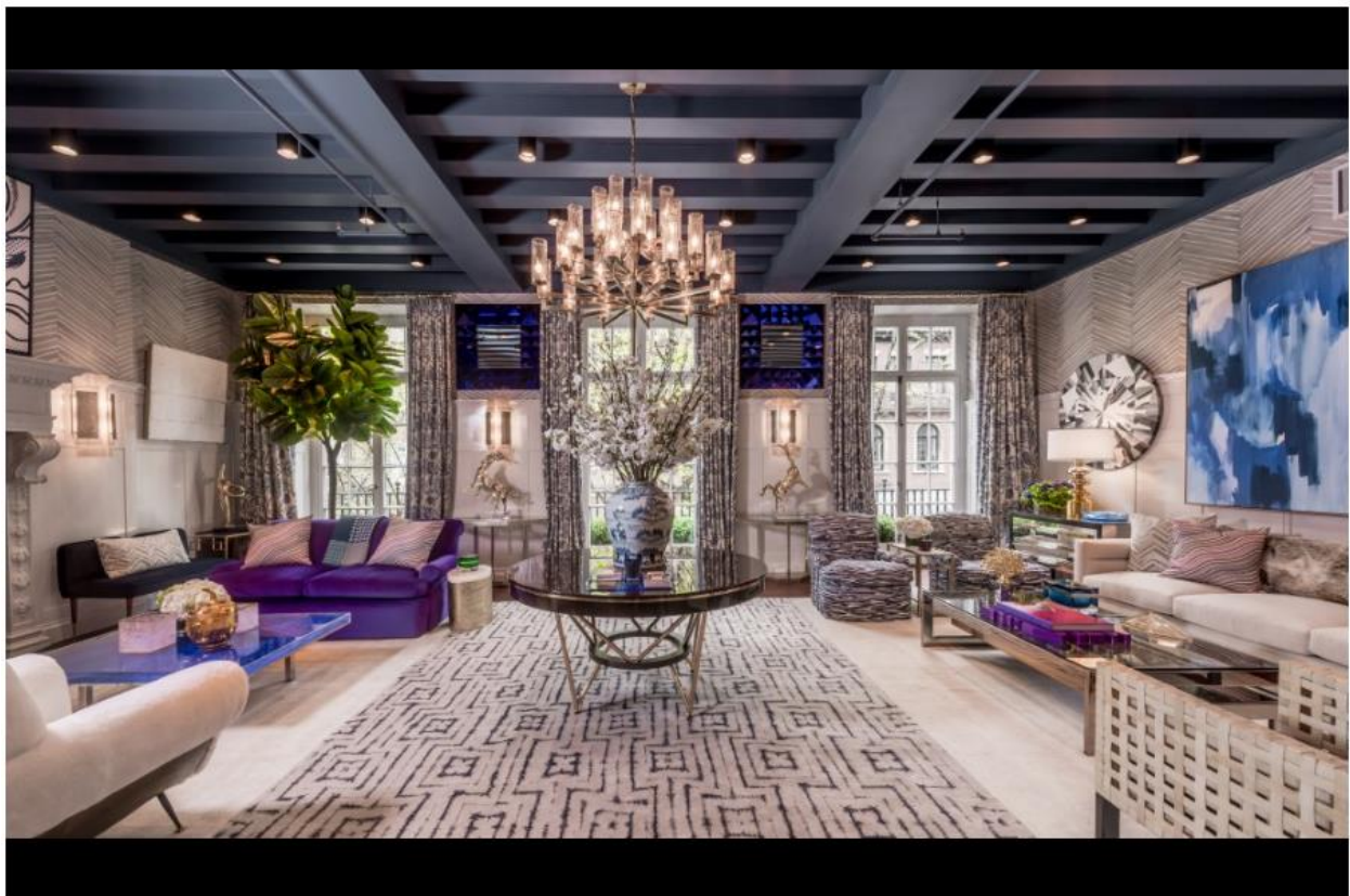
Kirsten Fitzgibbons and Kelli Ford of Kirsten Kelli call their drawing room "Simpatico," with a happy, light vibe and a casual flow.