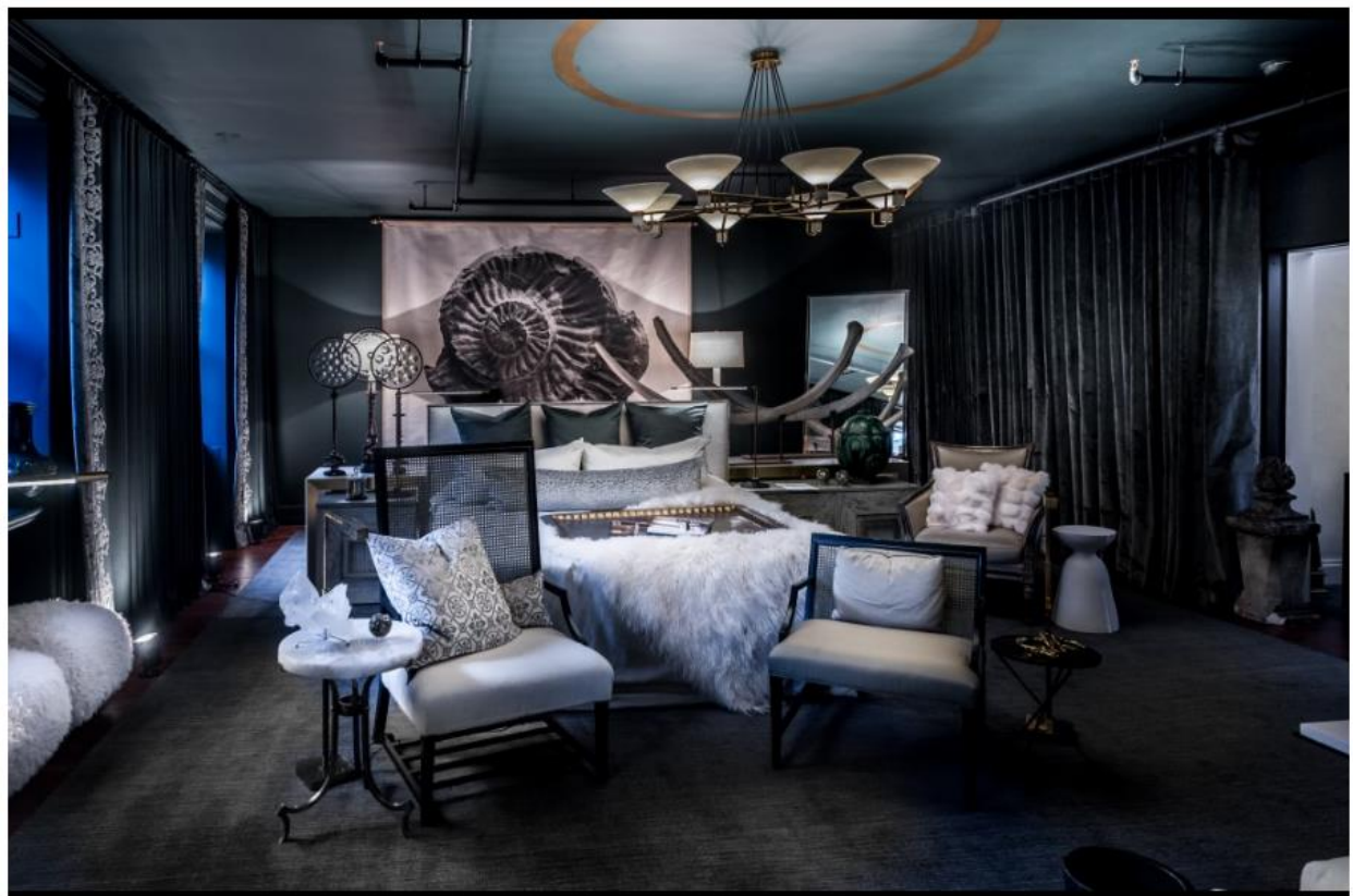
A master bedroom by Susan Ferrier of McAlpine is titled "Moonlight in the Forest." The color palette is anchored by wall-to-wall green silk and wool drapes.