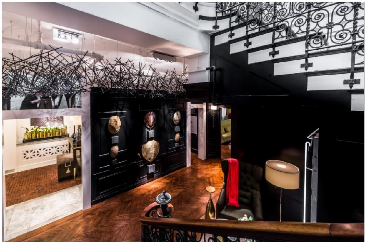
The entryway gallery by Powell & Bonnell has a black-and-white palette, with playful elements such as a ceiling-suspended installation and a stainless steel sculpture.