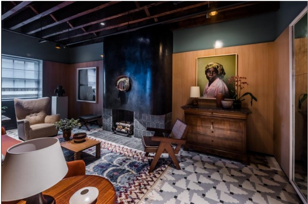
The attic sitting room by Neal Beckstedt Studio is imagined as the globally influenced space of a jet-setting collector. High-gloss blue walls highlight the home's structural beams.