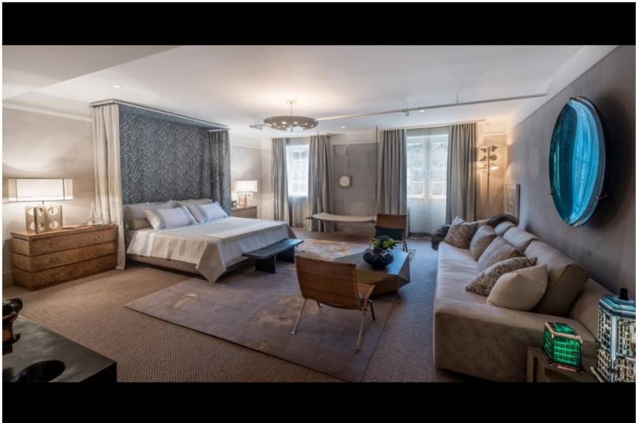
This master bedroom was designed by Dineen Architecture + Design. The cashmere and silk area rug is from Edward Fields.