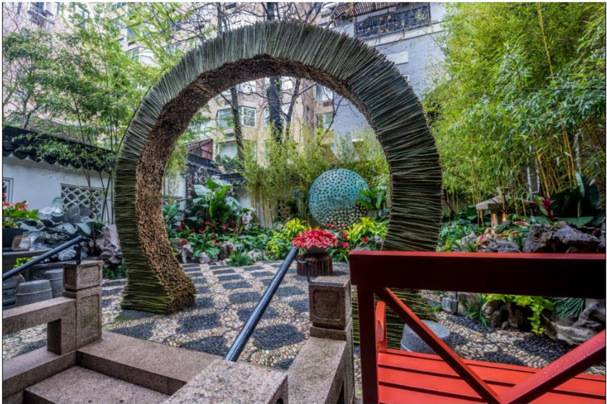
The Bamboo Court by Janice Parker Landscape Architects honors the building's history as the China Institute of America's former headquarters, with handmade pebble mosaic paving and wall details of a traditional Chinese garden. Bamboo plantings create a lush grove.