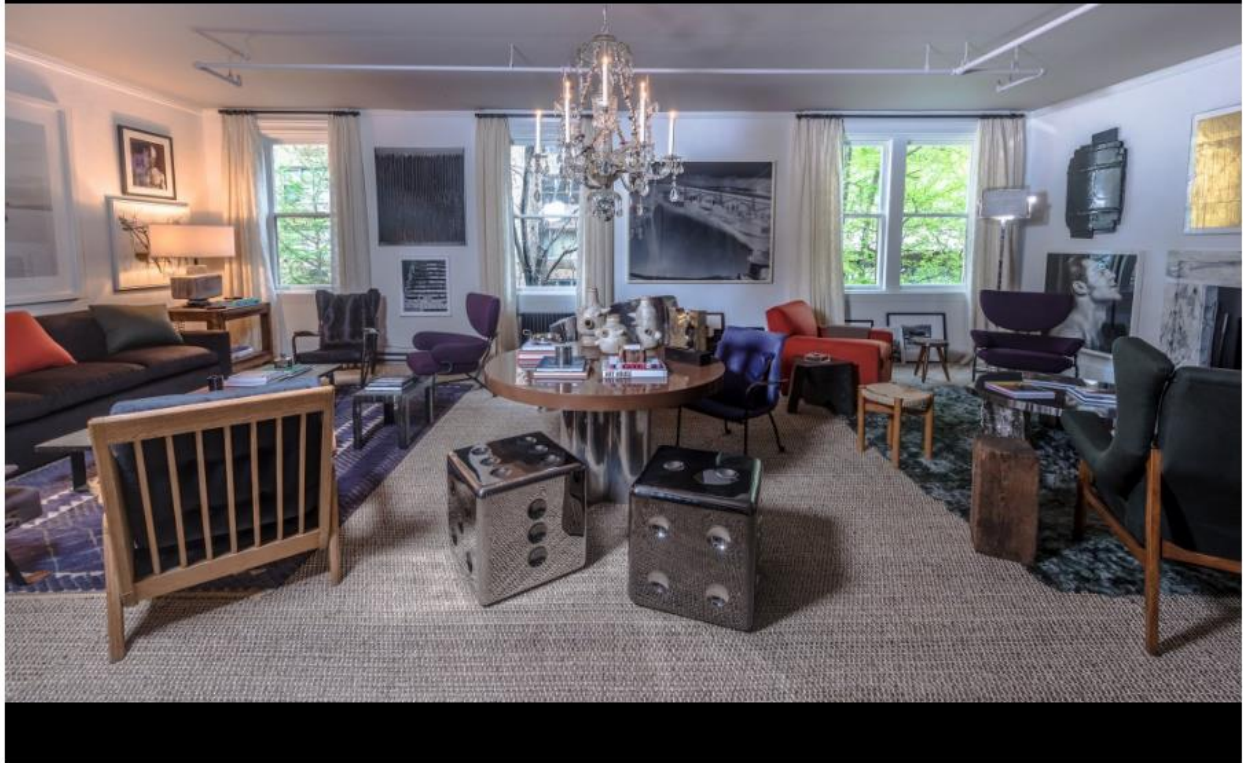
The living room by Robert Stilin is inspired by contemporary European salons. The Kips Bay Decorator Show House is at 125 East 65th St., New York. Tickets are $35 and can be bought at the door or at kipsbaydecoratorshowhouse.org .