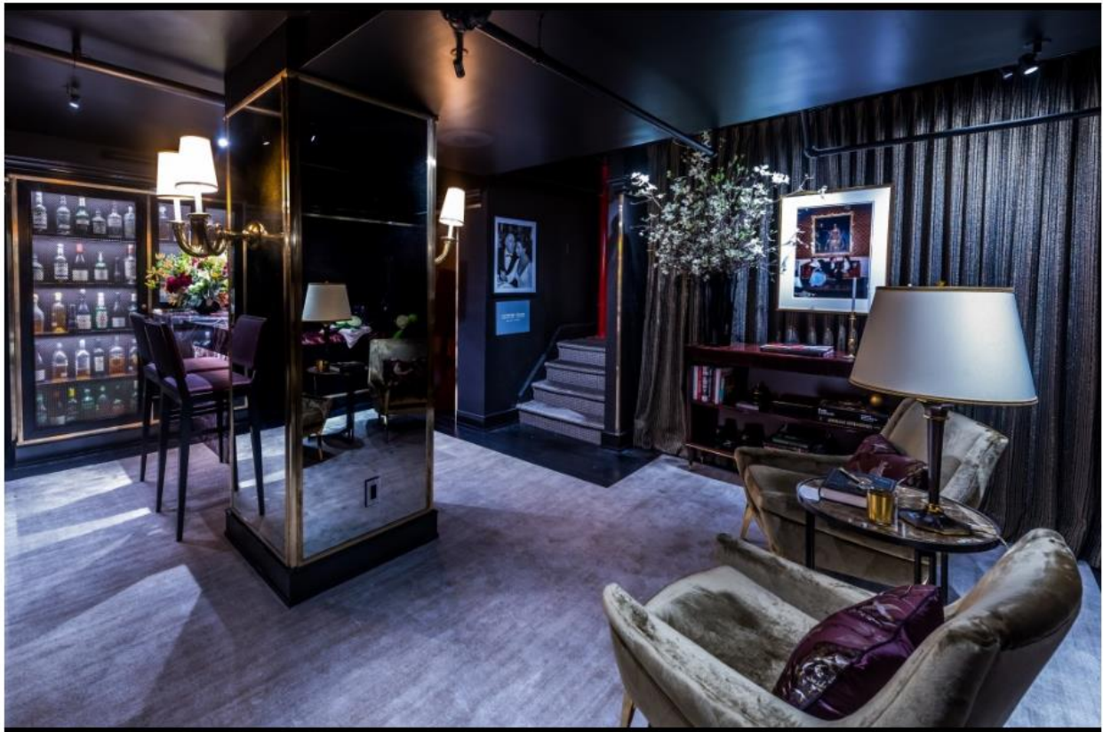
The lounge and bar, by Lichten Craig, presented a challenge because of low ceilings with soffits and the absence of natural light. The design team created an intimate space, with dark walls and ceilings camouflaging piping and irregularities. A pair of Charles Ramos chairs are upholstered in rich champagne silk