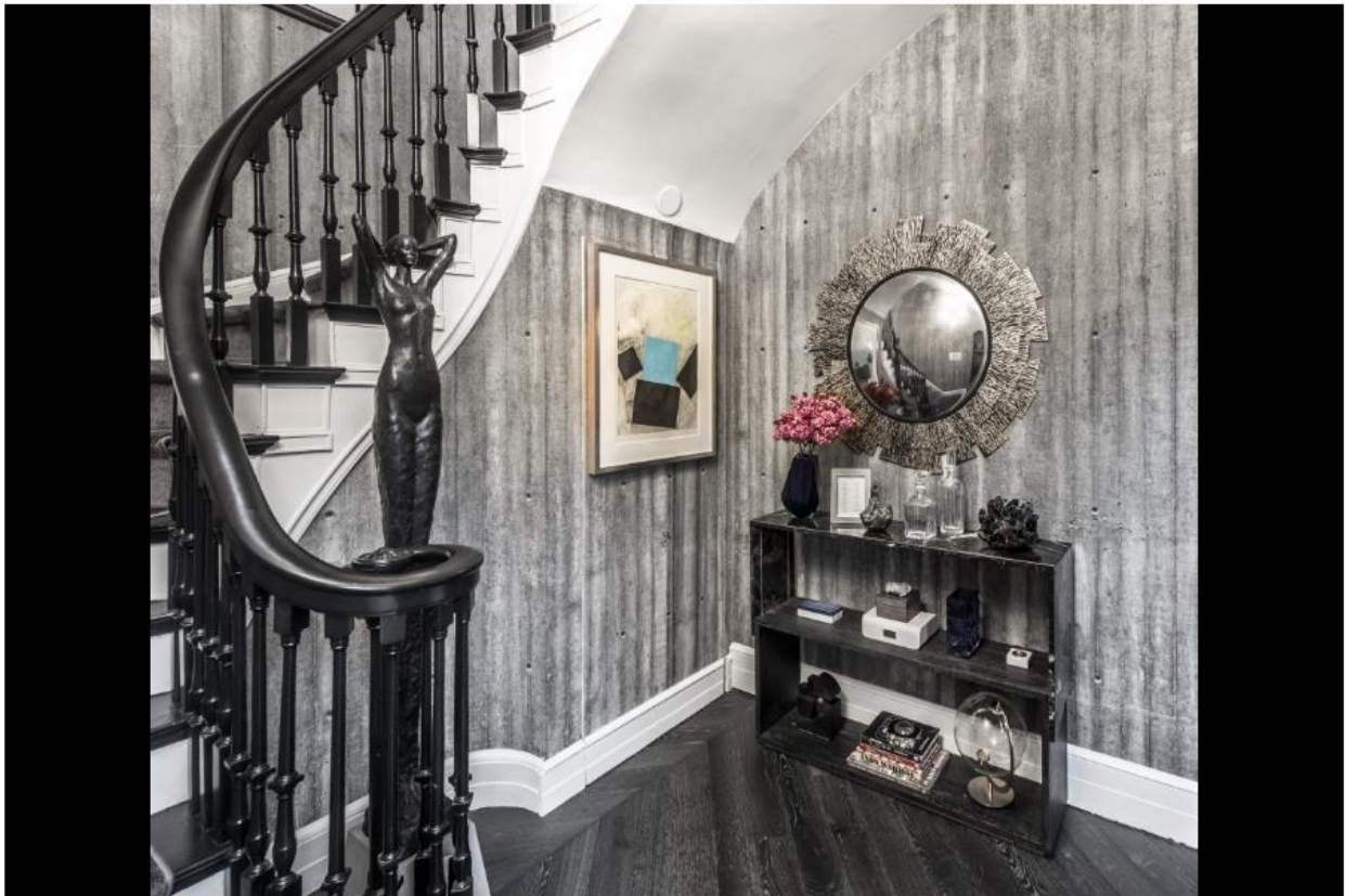
The second-floor staircase was designed by Scarpidis Design, using a classical banister and wrapping concrete wallpaper. Scarpidis also designed the third-floor gallery and bathroom.