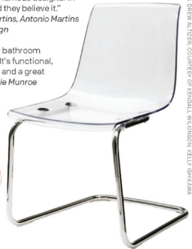
CLOCKWISE FROM TOP: LEFT: COURTESY OF COUP D'ETAT; COURTESY OF BARNEYS NEW YORK; COURTESY OF CB2; COURTESY OF IKEA; JEFFERS: MATTHEW WILLMAN; CODDINGTON: DREW ALTZER; COURTESY OF KENDALL WILKINSON; KELLY ISHIKAWA