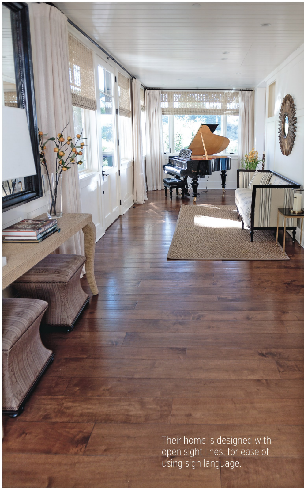
Their home is designed with open sight lines, for ease of using sign language.