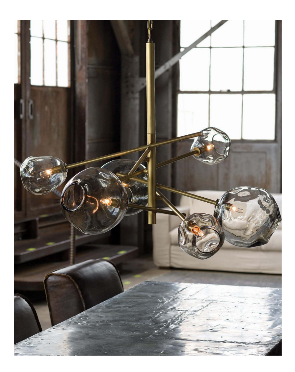
TRY A VINTAGE TUBE FILAMENT BULB WITH GLASS OR TRANSPARENT SHADES

o often we work on the overall design of a room, pouring over each element in excruciating detail (how many shades of white can we pull swatches of, really?!) – yet the lightbulb is typically just an after-thought. Here are a few ideas to inspire you to add a "wow" factor to your next lighting project.