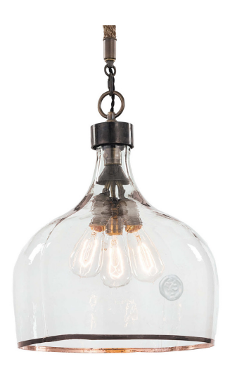
16-1102 Demi John Pendant