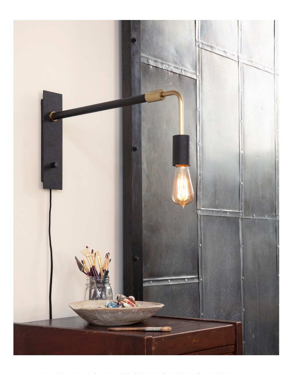
PAIR PLUG-IN TASK LIGHTING WITH AN EDISON BULB