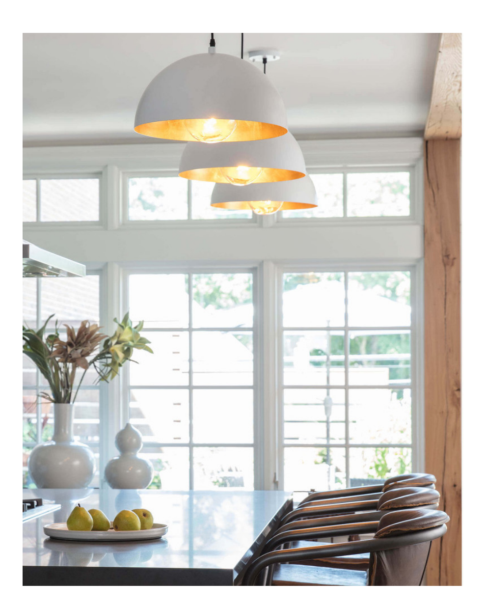
PAIR A UNIQUE BULB WITH A PENDANT FOR AN UNEXPECTED TWIST