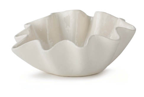
20-1268 Ruffle Ceramic Bowl Medium