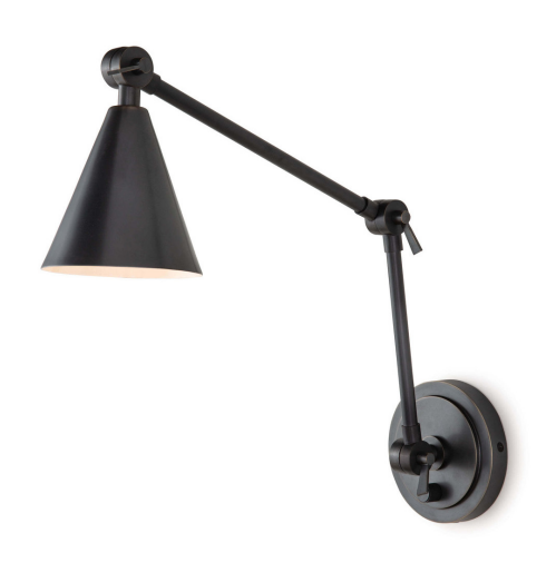
15-1115ORB Sal Task Sconce