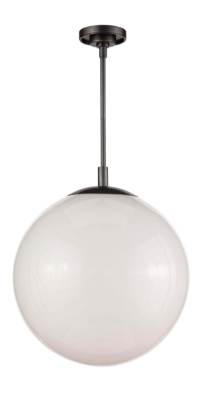
16-1251 Bistro Pendant Medium