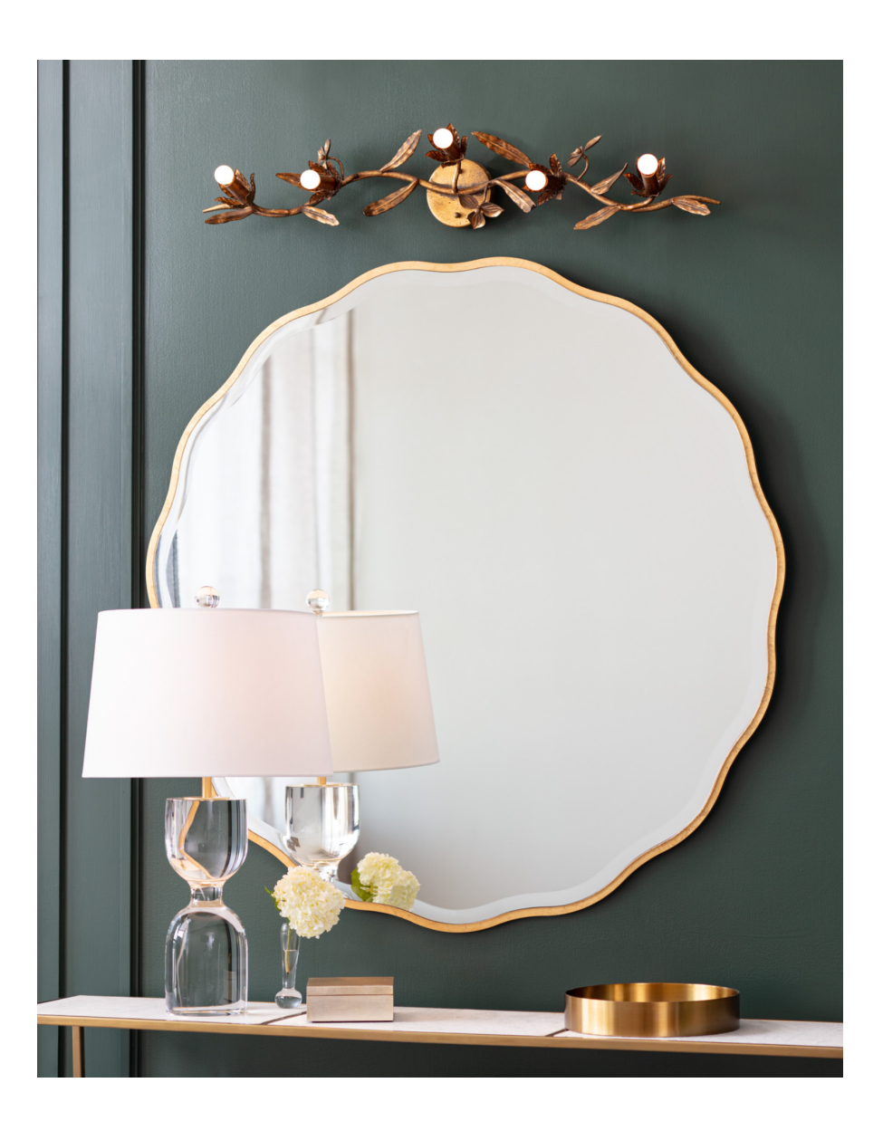
CHOOSE A MATTE WHITE BULB TO ACHIEVE A MORE DIFFUSED AND SOFTER LOOK