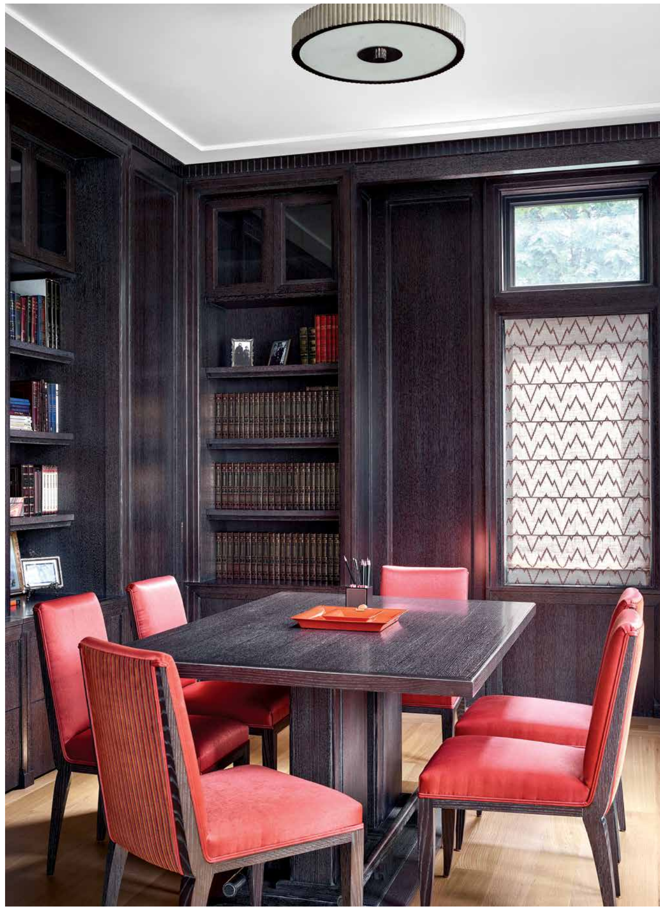
Inspired by the style of Jean-Michel Frank, a table conceived by JFID Custom Design and fabricated by Cisneros Custom Furniture serves as both a desk and a conference table in the husband's wood-paneled office. The custom Roman shades are by Dezing Sewing, and the wide-plank European white-oak flooring is from Rode Bros.