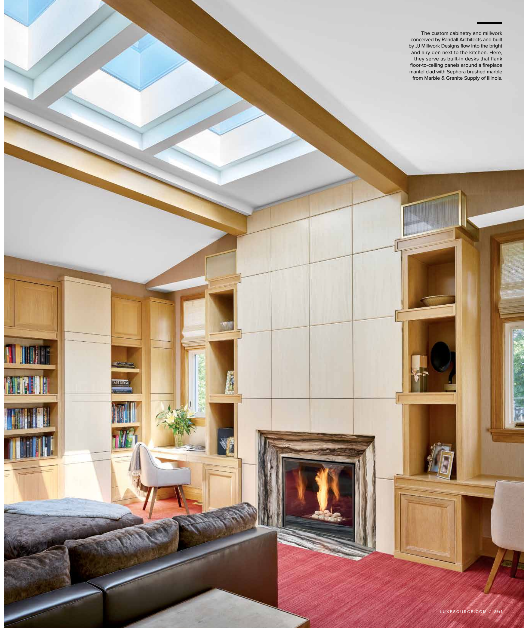
The custom cabinetry and millwork conceived by Randall Architects and built by JJ Millwork Designs flow into the bright and airy den next to the kitchen. Here, they serve as built-in desks that flank floor-to-ceiling panels around a fireplace mantel clad with Sephora brushed marble from Marble & Granite Supply of Illinois.