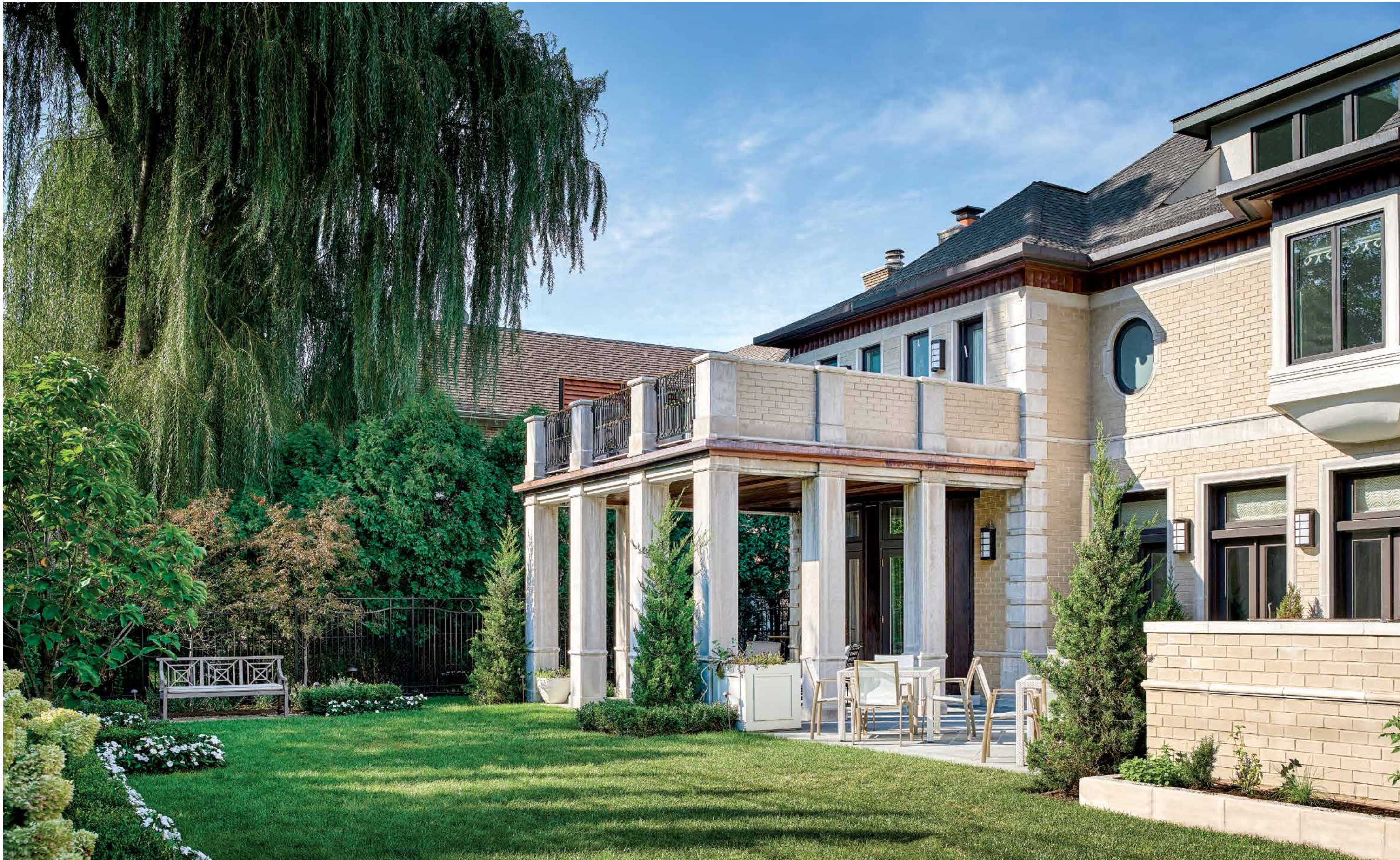
Elegant enough to merit its position just outside the formal living room, the back patio includes lounge furniture from the Tuxedo Salon Set by Amalfi Living from Bradley Terrace. The landscape was conceived by Julie deLeon.