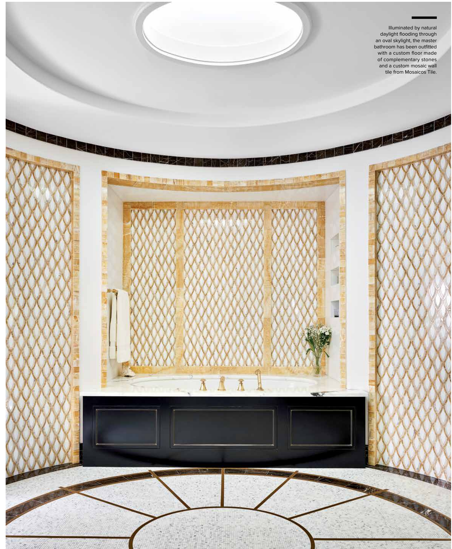
Illuminated by natural daylight flooding through an oval skylight, the master bathroom has been outfitted with a custom floor made of complementary stones and a custom mosaic wall tile from Mosaicos Tile.