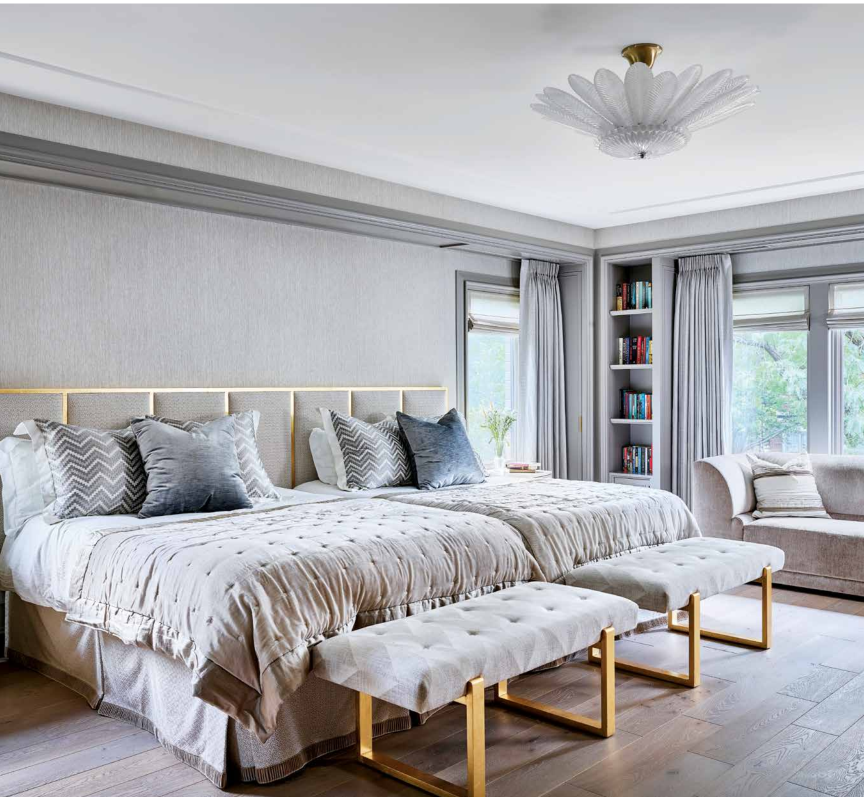
An oversize wood headboard with gold leaf, conceived by JFID Custom Design and fabricated by Cisneros Custom Furniture, extends over two beds; the pair of benches at the foot of each bed are also by JFID Custom Design and Cisneros Custom Furniture. The custom linens are from Feathers & Lace in Brooklyn.