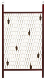
Paul Evans Room Divider