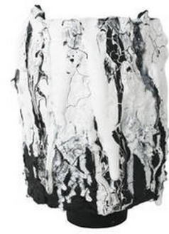
Contemporary Ceramic Vessel