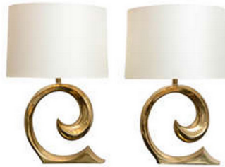
Pierre Cardin Lamps