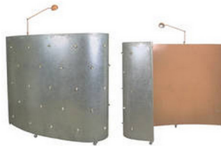
Floor Lamp and Room Divider