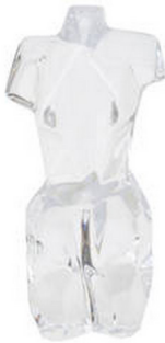
French Daum Crystal Glass Cubist Torso Sculpture