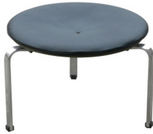
Poul Kjaerholm PK33 Stool