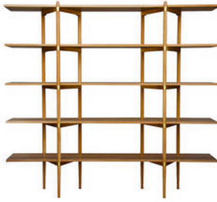
Primo 2/5 Ash with Stainless