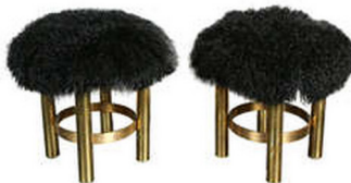
Pom Pom Hollywood Regency Ottomans Seat