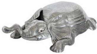
Vintage Arthur Court Elephant Form Serving Dish