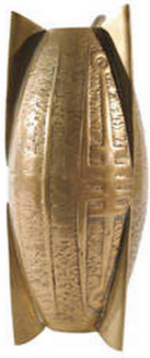
Modernist Bronze Vase