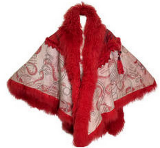
Rare Vintage 1986 Zandra Rhodes Limited Reversible Hand Painted Fur Cape