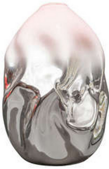
Crumpled Glass Sculptural Vessel, Hand-Blown by Jeff Zimmerman, 2014