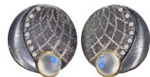
Atelier Zobel Blue Moonstone Diamond Bubble Earrings