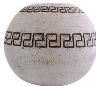
Large 1970's pottery vase