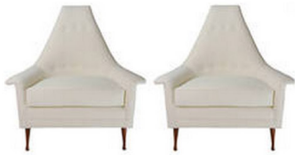
Pair of Italian Style Mid-Century Lounge Chairs