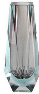
A Murano Sommerso Faceted Glass Vase with a Pale Grey Centre