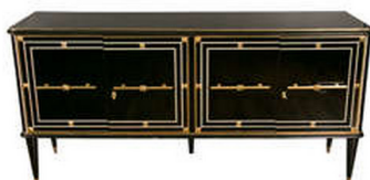
Elegant Black Mirror Buffet