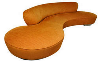
Vladimir Kagan Serpentine Sofa