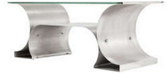
Stainless Steel 'X' series Coffee Table by Michel Boyer, circa 1968