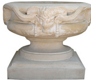
Paris Stone Planter

POTTERTON BOOKS The Bookshop for Art & Design