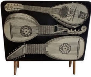
Piero Fornasetti Magazine Stand