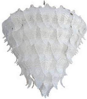
Leaf Chandelier in the Style of Seguso