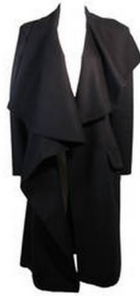
John Galliano Over-Sized Asymmetrical Collar Coat Size 10 42