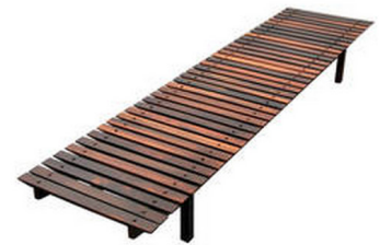
Impressively Long Mucki Bench by Sergio Rodrigues