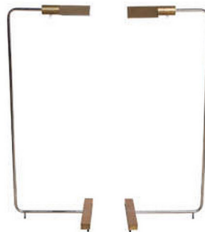
pair of Cedric Hartman Brass Floor Lamps