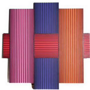
Richard Anuszkiewicz Translumina with Deep Blue, 1987