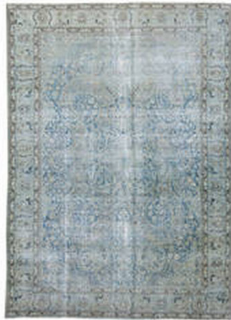
Antique Persian Tabriz Rug