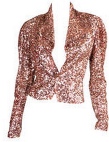
1940's Rose Gold Sequined Jacket