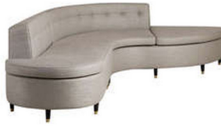
A Two Part Buttoned Back Sectional Sofa by Talisman Bespoke