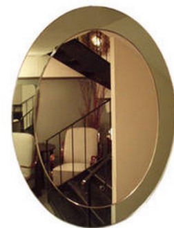
Oval Wall Mirror in the Style of Fontana Arte