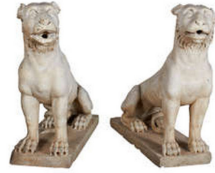
18th Century Italian Marble Lions