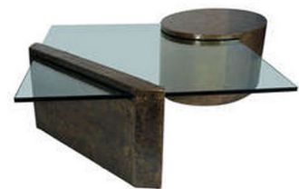
Silas Seandel Rare Cocktail Table