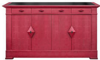
"Pergamon Credenza" in Burgundy Embossed Lizard Leather by Karl Springer