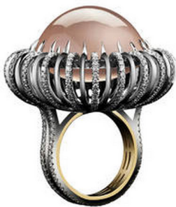
Star Rose Quartz Cabochon Diamond Gold Platinum Knife-Edge Ring