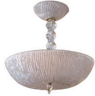
Shimmery Murano Chandelier