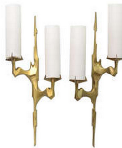
Pair of Italian Modern Bronze and Glass Wall Lights