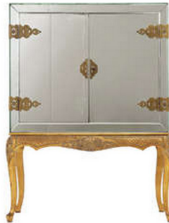
Silver Mirrored Glass Art Deco Cabinet, France