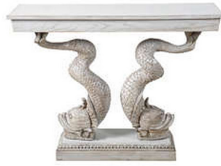
Carved Double Dolphin Console