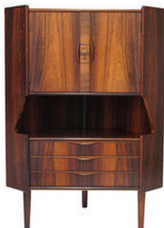
Danish Omann Jun Rosewood Bar Cabinet