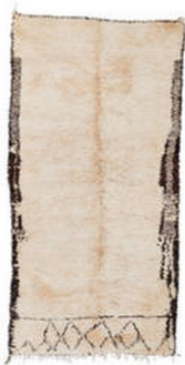
Vintage Moroccan Berber Rug