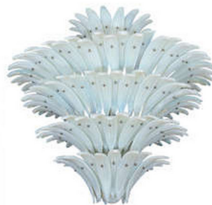
1970s Opaline Murano Leaf Chandelier