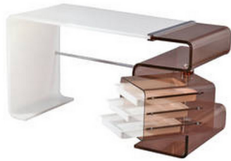
molded white and smoked lucite desk by Rena Dumas - France 1970