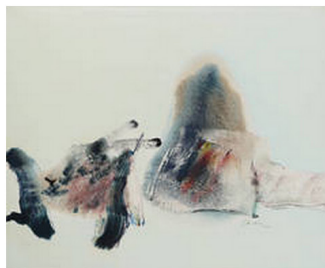
Chuang Che Untitled 9, 1983