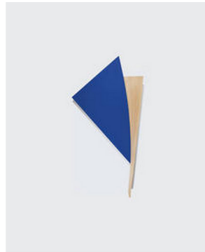
Tony Delap Bluey-Bluey, 1992