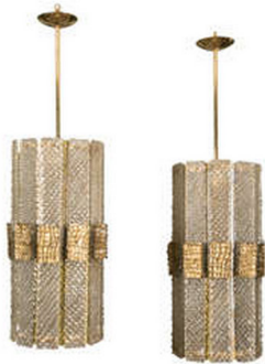
Beautiful Pair of Murano Glass Lanterns