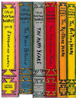
The Cecil Beaton Diaries (set Of 6) 1922-1974