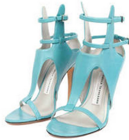
Camilla Skovgaard Light Aqua Blue High Heeled Sandelin