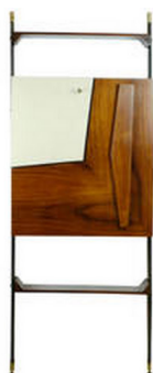
Italian 1950s Walnut and Leather Bar