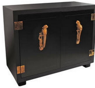
Vintage Henrendon Asian-Style Cabinet