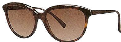
Vera Wang, $300.