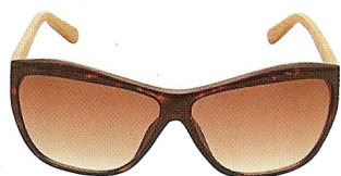
Juicy Couture, $135.

Turn and face the sun with one of spring's top tortoiseshell shades.