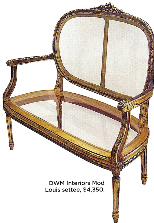
DWM Interiors Mod Louis settee, $4,350.

M ichael Kors shot his spring ad campaign in Malibu, the very place that inspired the collection. And, this year, the consummate stylemaker celebrates his 30th anniversary by opening four new locations in the Golden State (Roseville, Santa Anita, Valley Fair and Livermore Valley) and will venture into the realm of jewelry in the fall. The journey in classic, sporty-chic continues. michaelkors.com .