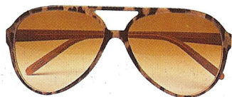
Dolce & Gabbana, $260.