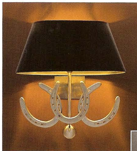
The Horseshoe Wall Sconce (prices range from $825 - $1,076 depending upon finish) features authentic horseshoes in a variety of finishes, including satin nickel, chrome, and colored patinas, and is topped with a sophisticated black shade with gold trim.

Robert W. Miller, ASID, and Jacob Scherer