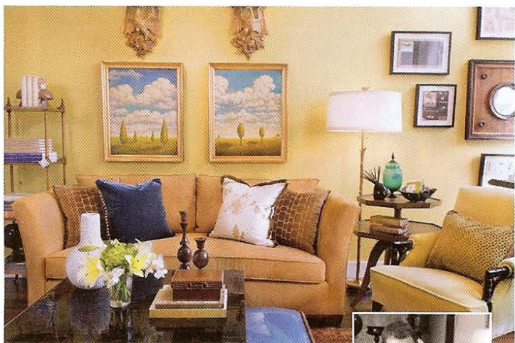
Jak Home is a new resource for those wanting more than mass market shops or catalog offerings.