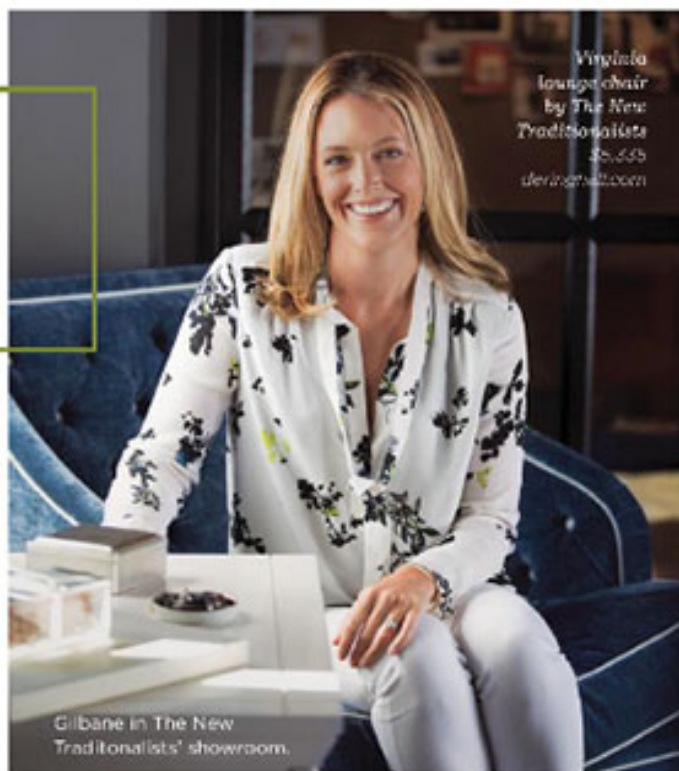
Virginia lounge chair by The New Traditionalists $5,555 deringstall.com

For the inaugural collaboration of The New Traditionalists' private label series, the company asked Sara Gilbane to create a line of seven original furnishings. Gilbane, an interior design star since opening her own firm in 2008, jumped at the chance to apply her vivacious style to some classic silhouettes. Inspired by her favorite French antiques (as well as her own custom creations), she crafted a line of posh, practical pieces—a curvy cocktail table, a sinuously tufted loveseat, a sleek daybed that doubles as a sofa—that aren't commonly found in the mass market. "I wanted to offer a playful twist on timeless shapes," says Gilbane. "These are items I'll return to again and again because of their functionality and scale."