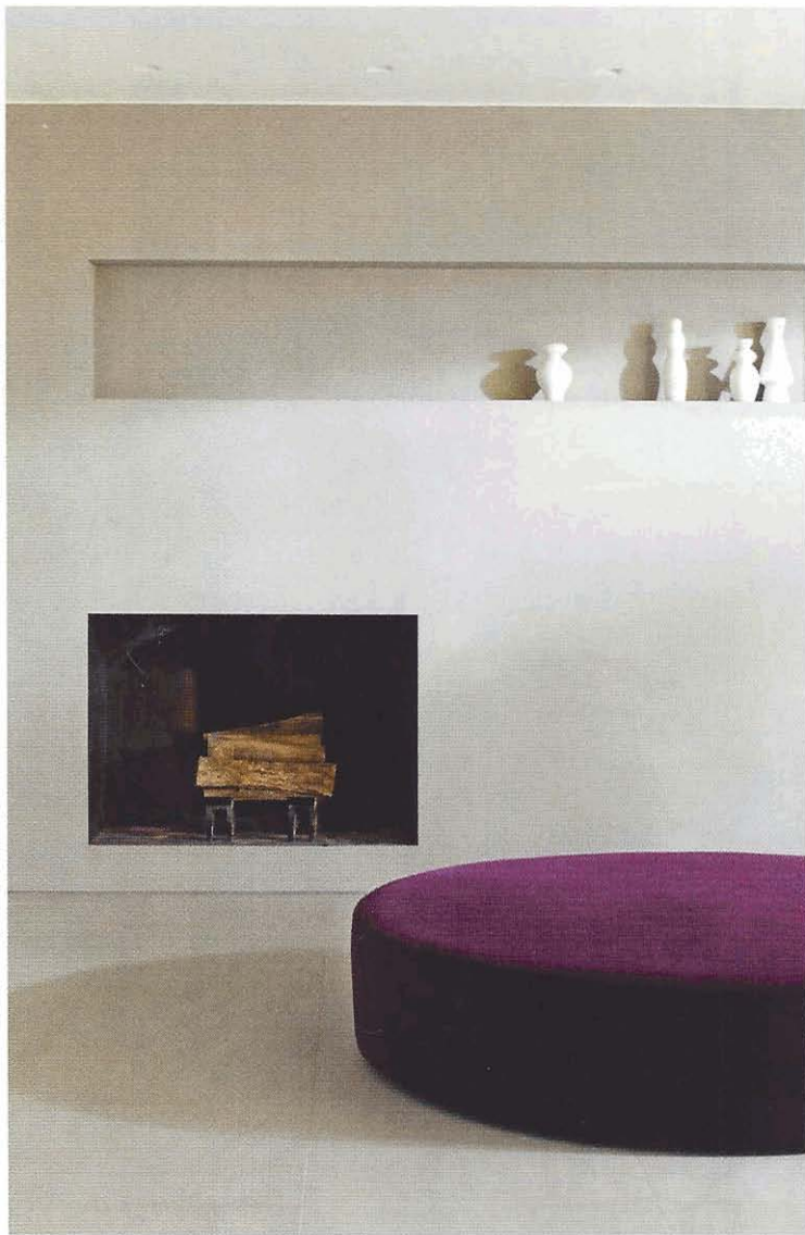
Above: An ottoman by B&B Italia sits beside the office's fireplace. Opposite: In the media room, a cocktail table by Bright Chair Co. is positioned between a B&B Italia swivel chair and a sectional sofa by Minotti from DDC; the carpet is by Calvin Klein Home.