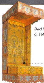
Bed hangings, c. 1690-1715.