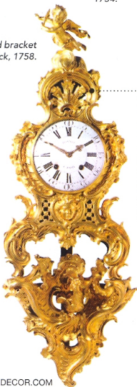
Gilded bracket clock, 1758.