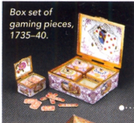
Box set of gaming pieces, 1735-40.