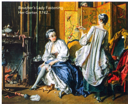
Boucher's Lady Fastening Her Garter, 1742.

For centuries, people have aspired to the trappings of the good life. "Paris: Life & Luxury," a new exhibition at the Getty Center in Los Angeles (April 26 to August 7), demonstrates that in the French capital of the 18th century the symbols of status were ornate and gilded. In the Manhattan of today, they tend to be sleek and silvery. But the impulse behind the acquisitions never changes—the desire to impress with the best.