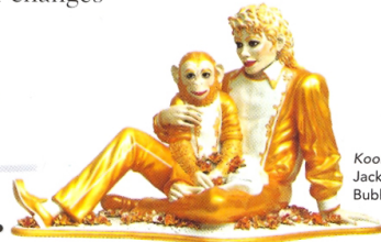
Koons's Michael Jackson and Bubbles, 1988.