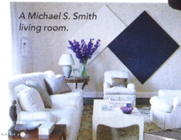
A Michael S. Smith living room.