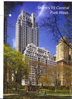
Stern's 15 Central Park West.

damask bed hangings Savoir and Hästens mattresses